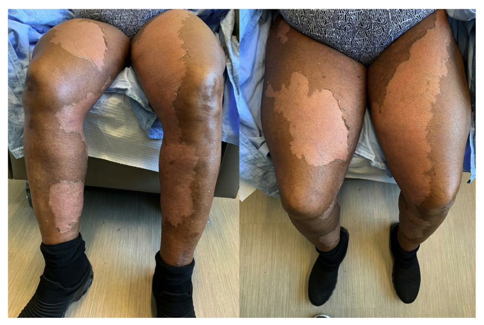
Fig 1. Exfoliative dermatitis secondary to enfortumab vedotin. Large, well-demarcated, desquamated patches along the anterior and posterior aspects of the lower parts of the legs.