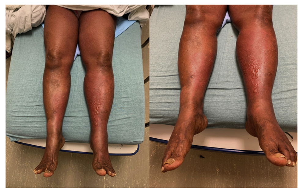
Fig 2. Patches of erythema on the proximal aspects of the thighs, developing into erythematous plaques with multiple tense bullae on the medial-anterior aspects of the shins bilaterally, with patches of hyperpigmentation and hypopigmentation from prior desquamation on the lower extremities.

toxic epidermal necrolysis (TEN), or bullous drug eruption.