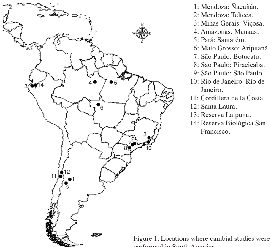
Figure 1. Locations where cambial studies were performed in South America.

Studies on cambial periodicity in South America are mostly performed using band dendrometers to measure radial growth ( e.g. , Alvim & Alvim 1964; Prévost & Puig 1981; Détienne et al. 1988; Botosso & Vetter 1991; Worbes 1999; Botosso et al. 2000; Tomazello-Filho et al. 2000; Schöngart et al. 2002; Dünisch et al. 2002, 2003; Callado et al. 2004; Ferreira-Fedele et al. 2004; Dünisch 2005; Figueiredo-Filho et al. 2008; Lisi et al. 2008; Bräuning et al. 2009; Pérez et al. 2009; Volland-Voigt et al. 2011; Cardoso et al. 2012) or using cambium mechanical injury techniques, such as the Mariaux window or the pinning method ( e.g. , Détienne et al. 1988; Botosso & Vetter 1991; Détienne 1995; Worbes 1997, 1999; Bauch & Dünisch 2000; Tomazello-Filho et al. 2000; Callado et al. 2001a; Dünisch et al. 2002; Lisi et al. 2008; Brandes et al. 2011). Oliveira et al. (2007, 2009) used one of the oldest methods to study cambial activity: periodical sampling of the last growth rings by conventional increment borers and assessing the radial tree growth by visual inspections and measurements of the sequential formation of earlywood and latewood layers, associated with a formula that allows the evaluation of radial growth and the relationship between seasonal climate variation and tree-ring formation.