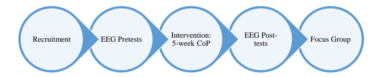
Figure 1 The Research Process

A novel, 5-week curriculum based on Rogers's concept of congruence, involving 16 hours of personal contact and 4 hours of virtual meetings, was designed to expand awareness, mitigate stress, and enhance sense of purpose. A mixed-methods process (Figure 1) was employed to provide a global understanding of the impact on resilience factors and specifically on cognitive control. Quantitative cognitive abilities were evaluated pre- and post-course by analyzing EEG-based tests of attention, focus, and apperception. Focus groups were convened and their proceedings recorded and linguistically analyzed to evaluate the program's qualitative effects.