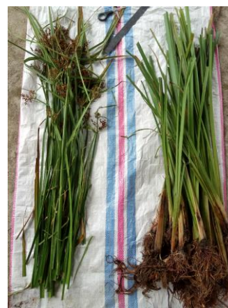
Figure 1. Washed mensiang

were obtained from MERCK, Germany, and distilled water are the chemicals used in the main process of furfural synthesis.