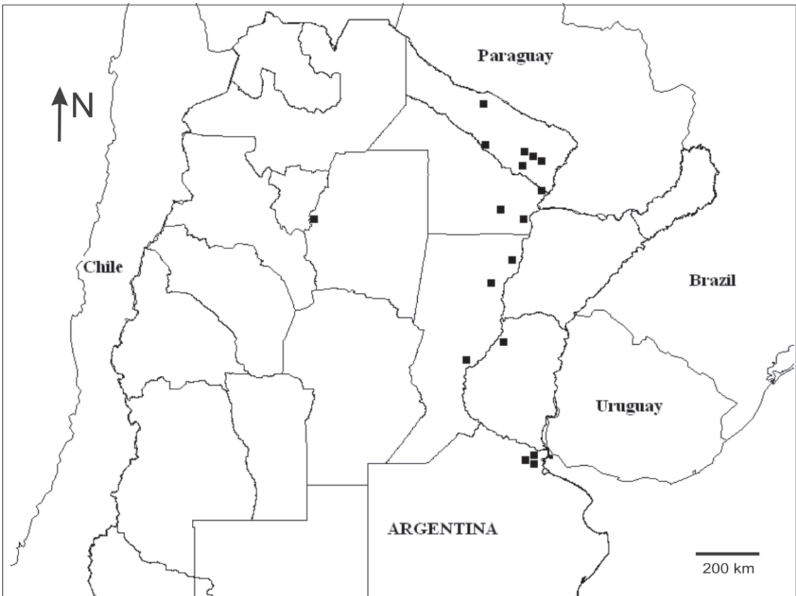
Fig. 11. Map of Argentina with collection sites for Lepidelphax pistiae gen. et sp. nov. (black squares).

Male: Small to medium-sized, predominantly brachypterous forms.