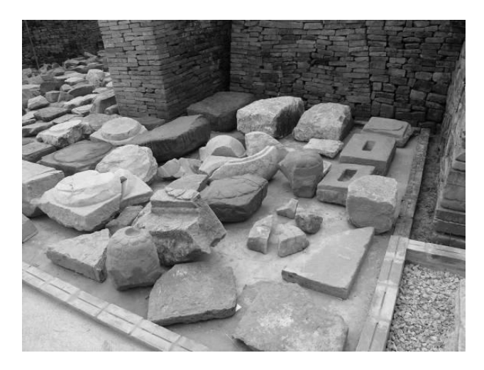
Figure 3. Architectural vestiges found in the Ba Dinh site.

Tong Trung Tin (2005) adds that the excavated trenches and relics demonstrate four major cultural layers. The oldest belongs to the Dai La or pre-Thang Long period, 7<sup>th</sup> to early 10<sup>th</sup> century, when Vietnam was ruled by the Tang Dynasty of China. The objects include burned timber columns and ceramics found at a depth of 3-4 meters in all four sections of the excavated area. The second layer belongs to the Ly-Tran period, from the 11<sup>th</sup> to 14<sup>th</sup> centuries. The remains were found at a depth of 2-3 meters in sections A, B and D, and belong to two dynasties: the Ly from the 11<sup>th</sup> and 12<sup>th</sup> centuries and the Tran from the 13<sup>th</sup> and 14<sup>th</sup> centuries. These two historical periods shared cultural similarities. The artifacts consist of building foundations, column bases decorated in typical Ly-Tran sculptural style, a square pond full of ceramic objects and wells tiled with red bricks. Other