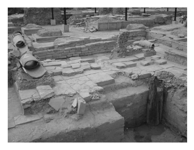
Figure 4. Tiled floors and drainage pipes exposed at Ba Dinh..

smaller artifacts include ceramic bowls, plates and boxes, replicas of towers, jars and pots. Many bricks were carved with Chinese characters showing the year of manufacture in 1057.