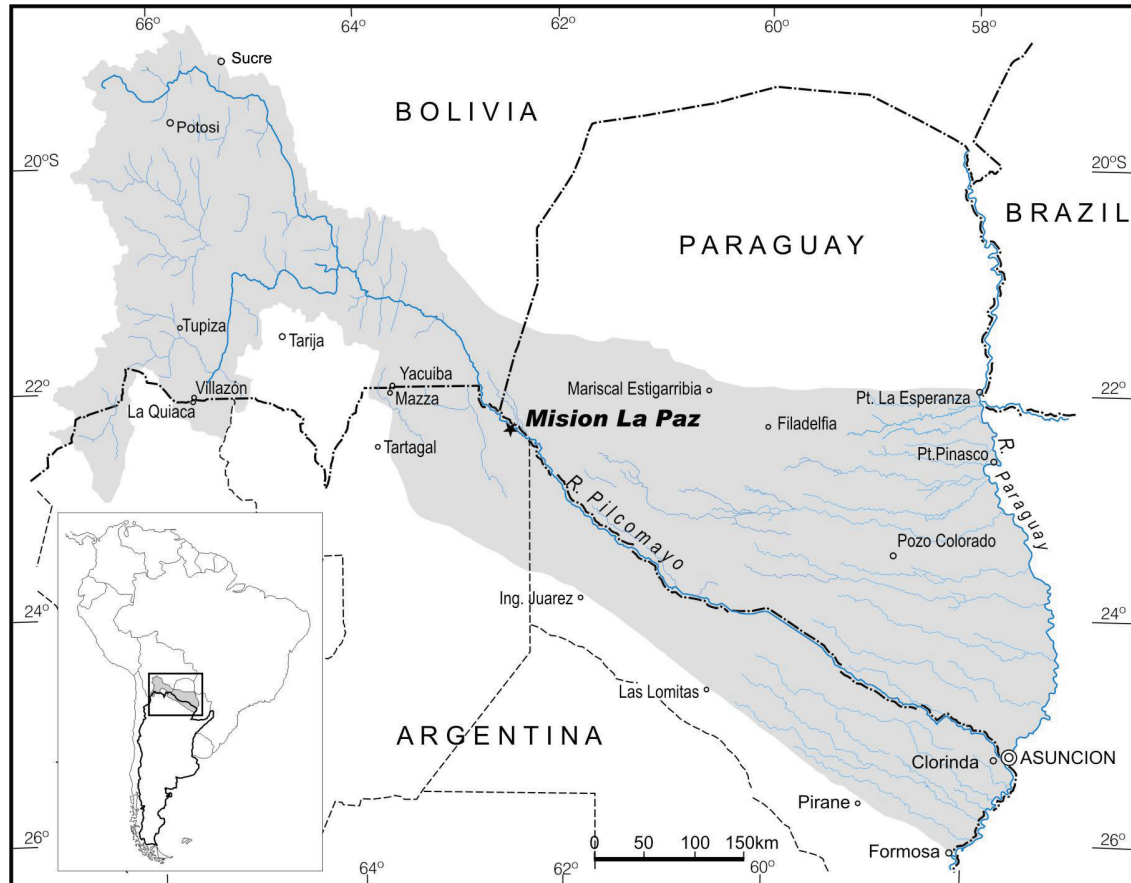
Figure 1. Map of Pilcomayo River basin with the water sampling location (Misión La Paz, Argentina)

waters are located in Bolivia along the eastern flank of the central Andes at an elevation of approximately 5,200 m (Figure 1). The river flows in a southeasterly direction until reaching the Chaco Plains along Bolivia's southern border with Argentina. Its total length is 2,426 km and its basin covers an area of approximately 288,360 km 2 ( http://www.pilcomayo.net/web/ ).