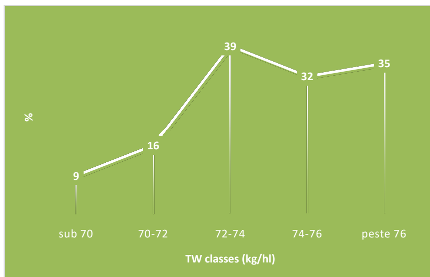
Fig.3 Percentage distribution in hectoliter mass classes of the varieties tested on the Caracal chernozem