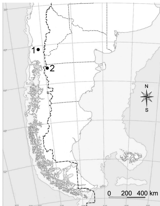
Fig. 2. Distribution of Leotia lubrica in Patagonia, southern South America. 1 , Chile, Los Lagos Region. 2 , Argentina, Chubut Province, Parque Nacional Lago Puelo.

Observations. The species of Leotia have traditionally been defined by the fresh color of the ascomata. However, a molecular phylogenetic study revealed that color is a poor predictor of species affiliation, suggesting that further study is needed to find new and more predictive species limits (Zhong & Pfister, 2004). The morphology and anatomy of the material collected in Parque Nacional Lago Puelo agree with the description given by Gamundí (1979) of Leotia lubrica recorded in Osorno, Chile, in Nothofagus obliqua (Mirb.) Oerst. ("roble pellín") forest. Some authors (e.g. Leimona & Velasco, 1975; Gamundí, 1979) consider that the species has 1-cellular and guttulate ascospores.