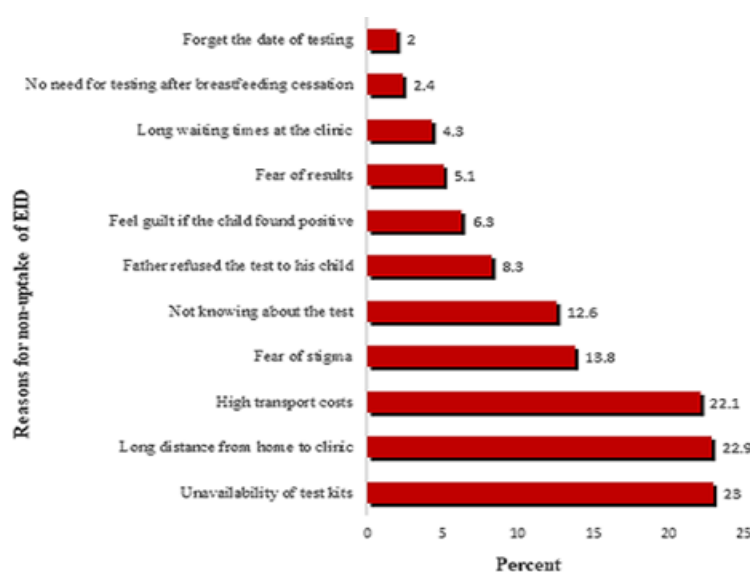
Figure 2: Reasons for non-uptake of the test among HIV exposed children, (n=253)