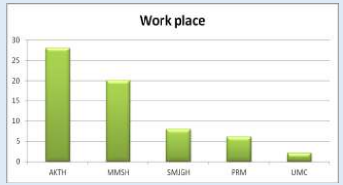
Figure 2: Distribution of respondents by work place.