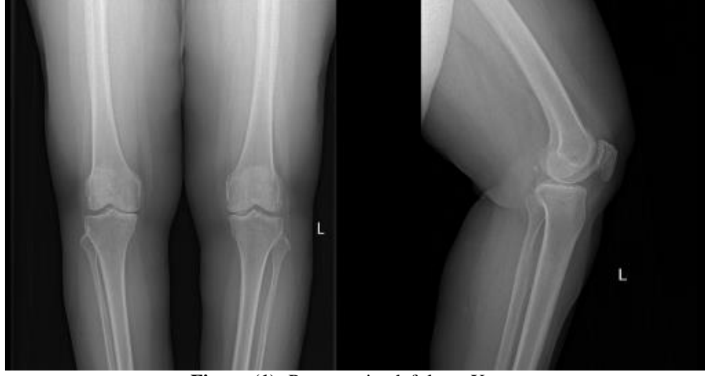
Figure (1): Preoperative left knee X-ray.