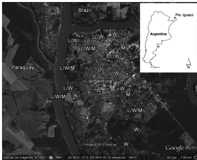
Fig. 1 - Distribution of Ny. whitmani (W), Lu. longipalpis (L) and Mg. migonei (M) in the city of Puerto Iguazú, Misiones Province, Argentina, November 24 th to 27 th , 2011.

climatic variables presented differences in the total abundance of Phlebotominae captured on the consecutive days ( F_{2,8} = 5.08; p = 0.0376 ). The day with the highest number of sand flies captured presented the lowest minimum temperature and the highest minimum relative humidity. Records of maximum temperature and maximum relative humidity showed no differences on sampling days (Table 2). The second day was not included in the analysis due to the fact that no sand fly was collected in the households where climatic variables were measured (minimum and maximum temperature, and minimum relative humidity and maximum relative humidity).