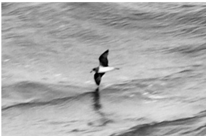
Fig. 2 Soft-plumaged petrel, north-east of the South Orkney Islands, February 2012.

Great-winged petrel ( Pterodroma macroptera ). We recorded three individuals, all in Antarctica, in the presence of strong winds and cold, ice-free water (Table 1). One of the birds flew about 15 m a.s.l. and followed the ship for a few seconds. This species has been previously recorded in Antarctic waters. In February 1994, 64 great-winged petrels in flocks of up to five were observed in the eastern Weddell Sea between 64 and 69°S, the southernmost record at 69°05'S and 21°24'W (Montalti et al. 1999; Fig. 1d). According to del Hoyo et al. (1992), the great-winged petrel is highly pelagic, widespread, but sparsely distributed at sea and occasionally strays into sub-Antarctic and Antarctic