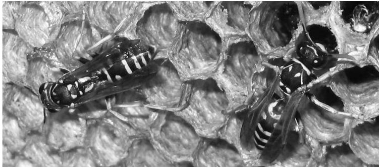
Figure 1. Females of Polistes dominulus at a nest in Saanich, BC, 30 September 2004.