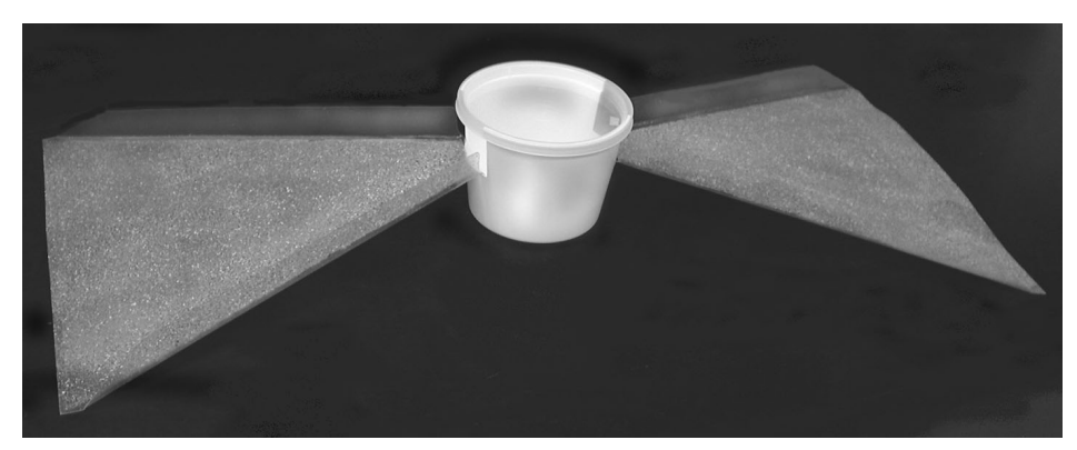
Figure 1. Ramp pitfall trap used for collection of Carabidae in organic apple orchards.

used a combination of mating disruption and sterile insect release to suppress moth populations (Dyck and Gardiner 1992). Orchards contained a mixture of apple cultivars (mainly McIntosh, Spartan, Red Delicious and Golden Delicious) and ranged in size from 0.5 to 4.4 ha. The orchard floors consisted of bare soil and/or vegetation (mainly orchard grass and broad leaf weeds) and were mowed routinely throughout the cropping season. In each orchard three ramp traps were placed beneath the tree canopy, 15 to 30 m apart. Samples were collected in a salt water solution (with a droplet of detergent) which was replaced when samples were removed, at 7 - 10 day intervals from 23 April - 19 October 1999, and 19 April - 2 November 2000. Samples were stored in 70% ethanol until carabid specimens were sorted and identified to species level using the keys of Canadian and Alaskan Carabidae developed by Lindroth (1961-1969b). Voucher specimens are currently held in the Insect Reference collection at the Agriculture and Agri-Food Canada, Atlantic Food & Horticulture Research Centre, Kentville, Nova Scotia.