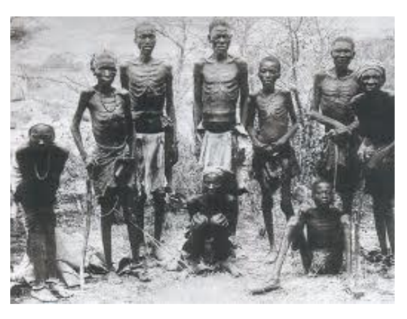
Figure 2. Images of survivors of the Herero genocide foreshadowed similar scenes from the liberation of Nazi death camps

https://www.smithsonianmag.com/history/brutalgenocide-colonial-africa-finally-gets-its-deservedrecognition-180957073/