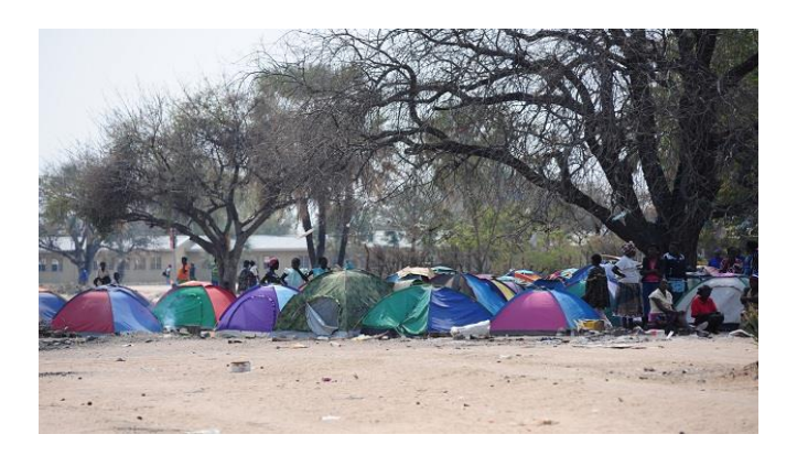
Figure\ 6.\ Source.\ World\ Health\ Organization\ https://www.who.int/news-room/feature-stories/detail/namibia-maternity-waiting-homes-protect-newborns-and-mothers

The findings from this research will help the ELCIN to re-empower, reorganize, restructure, and re-plan.