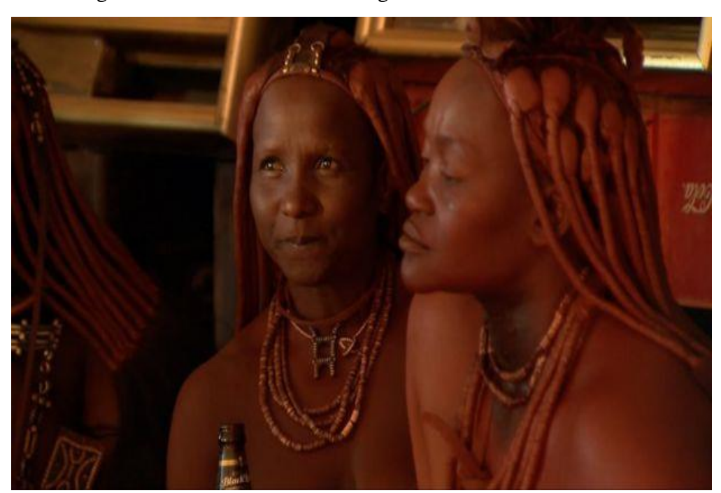
Figure 4: Himba Women Drinking Alcohol Drinks