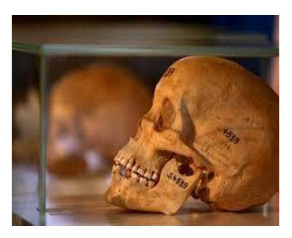
Figure 1. Germany returns human remains from Namibian genocide: https://www.namibian.com.na/180921/ar chive-read/Germany-returns-human-remains-from-Namibian-genocide