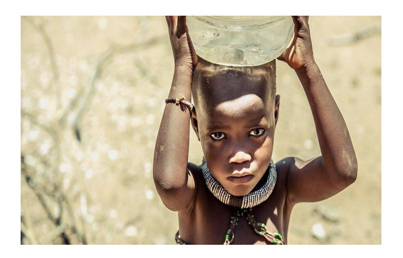
Figure 7.

The crisis of clean water in the Kunene region is a major concern in the area, where people suffer from thirst. We know that water is life, and without water, no one can survive in this world.