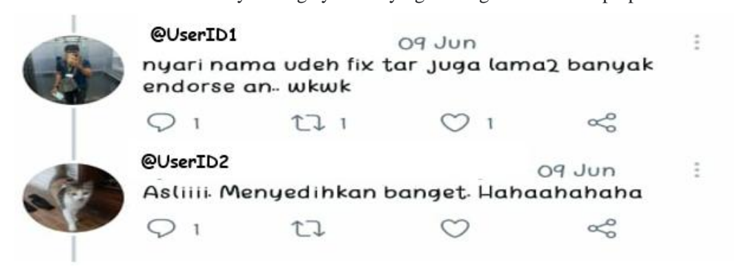
Figure 3. This picture shows Cyberbullying roles where there were the bully and bystander.

The first comment made by the bully or @Userid1 and the bystander supported him to blame the victim just wanted to be famous only to get endorse and then the @userid2 gave replies ironic comment by saying it was truly sad hahahahha." Based on that picture comments, it can be seen that the @UserID2 has aggressive behaviour where he sent the repeated cyberbullying comments with harsh language with those words. That comment showed negative empathy to a sexual harassment victim. Where is their morality if they still blamed the victim for being famous behind the perpetrator's name; hence, he is a public figure?