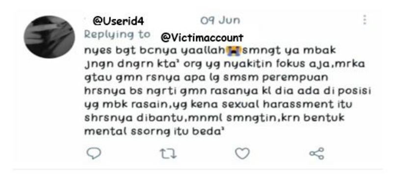
Figure 8. One of the positive tweet's responses to the victim's tweet.

Once someone decided to speak out about their terrible experience automatically, they were ready to get positive and negative responses. People could not expect every answer to be positive because every person has their perspective on one case. That was her first tweet of thread told her traumatic after that moment. She needed around three years just to speak up. She still gets tremors and hidden emotions if she does not accidentally see the perpetrators.