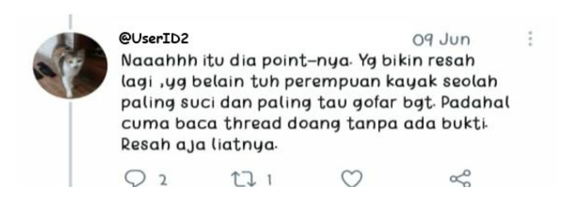
Figure 4. Bystander's comment for another tweet.

The first comment made by the bully or @Userid1 and the bystander supported him to blame the victim just wanted to be famous only to get endorse and then the @userid2 gave replies ironic comment by saying it was truly sad hahahahha." Based on that picture comments, it can be seen that the @UserID2 has aggressive behaviour where he sent the repeated cyberbullying comments with harsh language with those words. That comment showed negative empathy to a sexual harassment victim. Where is their morality if they still blamed the victim for being famous behind the perpetrator's name; hence, he is a public figure?