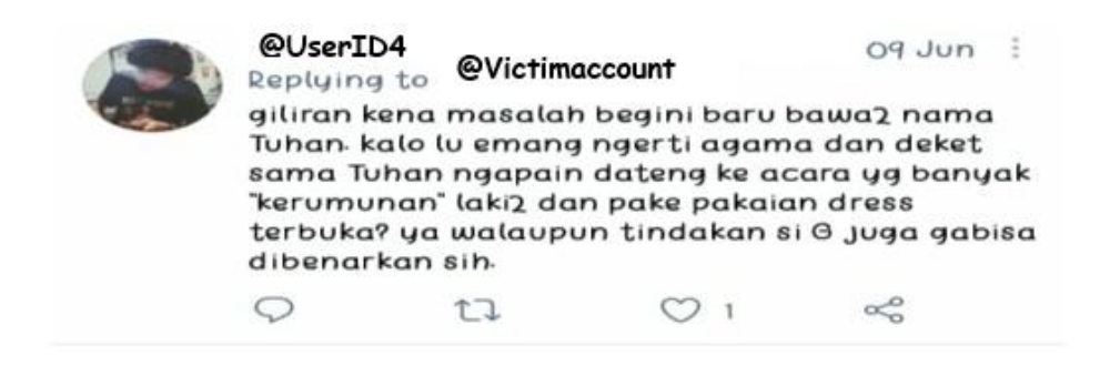
Figure 9. Negative comment's from one of the users.

apalagi sama-sama perempuan harusnya bisa ngerti gimana rasanya kalau dia ada di posisi yang mbak rasain, yang kena sexual harassment itu seharusnya dibantu, minimal semangatin, karena bentuk mental seseorang itu beda-beda." The commentator said that she felt brokenhearted to pieces when she read her thread. She supported the victims by saying not to hear the harsh words, just focused on herself because they did not know how it felt like sexual harassment victim. Even as a woman, we should have understood how was it felt in her position because she needed to help, at least supports, because everyone's mind is different." The user's comment showed positive empathic to the victim.