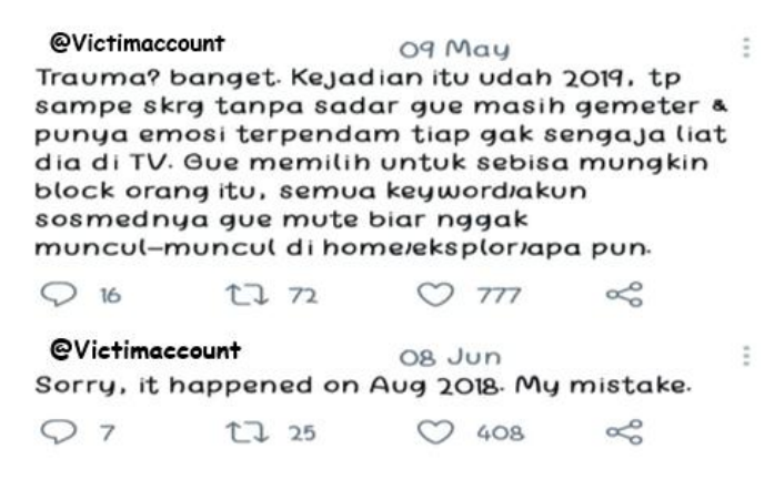
Figure 7. One of the victim's tweets showed how traumatic she was before.

In cyberbullying, the victim is someone who is the target or target of the oppression carried out by the bully on cyber media. In contrast to the perpetrators who have been bullied and bystanders, in cyberbullying cases studied by the victim, the victim is a single subject or an individual. From the case learned, it is known that the victim was a young adult who is the subject of cyberbullying of some people for the reactions of her thread.