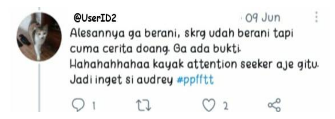
Figure 5. The bystander sent repeated cyberbullying comments with harsh contains.

Even though he did not realize he did the same, he discriminated against the women like the holiest. Those statements were categorized as harsh words for subjectivity, and there was no empathy at all.