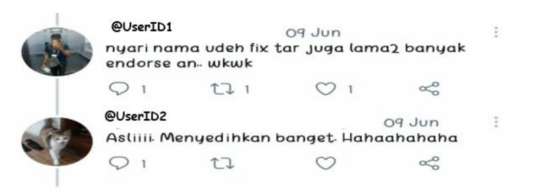
Figure 2. The bully and the bystander

In Twitter, a person can be a bystander if that person plays a role in sending cyberbullying messages on the links, statuses, and images provided by the bully to bully the victim. Bystander becomes a representation of an actual form of cyberbullying where the bystander carries out the majority attack of the victim. In some cases, the bully can also play the role of a bystander, attacking the victim by continuing to send cyberbullying messages on the link he sent himself.