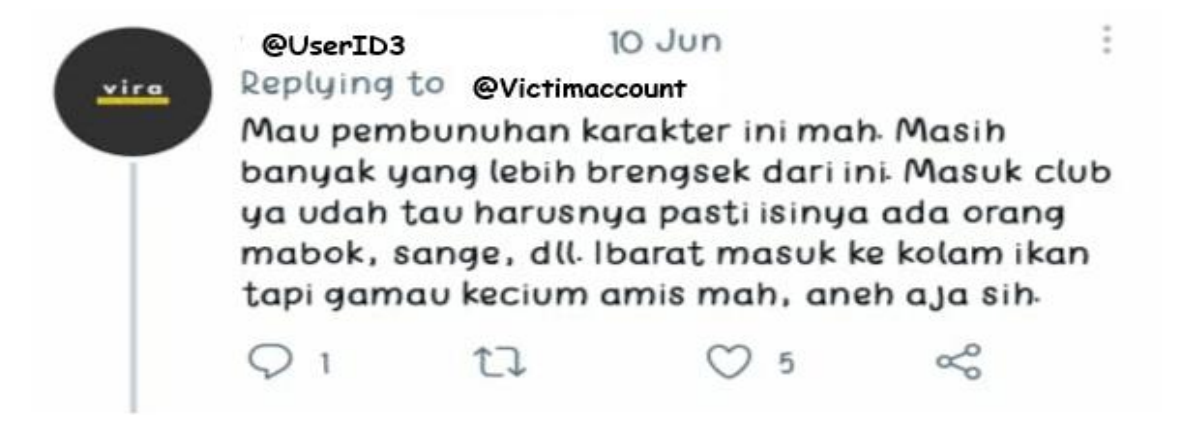
Figure 6. One of the not empathetic to other people's feelings.