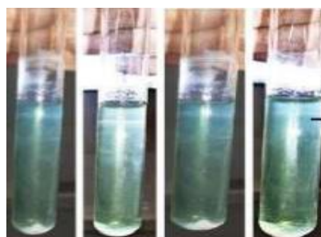
Figure 1. The results of the qualitative test of sample nitrogenase activity on semi-solid NFB media

Based on the research conducted, the results of the linear regression value for the standard curve are 0.095.