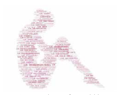
Fig. 8: Artistic visualisation of censored debate about Jiang Shanjiao.

Her original Weibo posts and related user comments are no longer accessible, as she has restricted access to her posts from before 22 April 2020 for unknown reasons. However, other users have documented the censored debate by providing screenshots of female blogger's @Why is it endless posts (Sijiubei 2020), alongside a list of rhetorical questions added by other users (Talk with you about sea and ice 2020). Furthermore, netizens found ways to circumvent algorithmic forms of social control by creating and publishing artwork with the censored words. For example, the following piece created by an unknown netizen (Fig. 8) and shared on Sijiubei's blog: