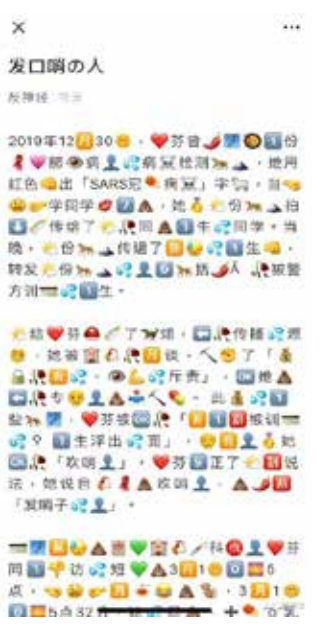
Fig. 10: Emoji version.