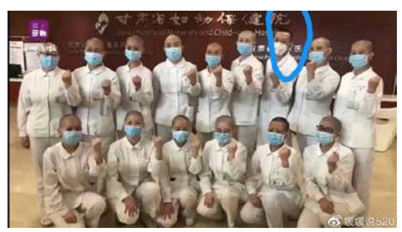
Fig. 5: An unshaved male medical professional.

wards, the news outlet Gansu Daily also published a video online showing nurses crying while being shaved (Fig. 6). These images triggered online controversy regarding gender equality.