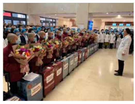
Fig. 1: Hospitals send medical teams to Wuhan.

From February onwards, female workers were included and "nurses at the frontline" became a high frequency phrase in news reports (Wumenglousuibi 2020). Hospital social media accounts documented nurses shaving their heads to prepare for the mission (Gansu Maternal and Child Health Hospital 2020) (Fig. 1).