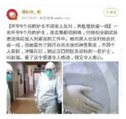
Fig. 3: Combat-ready during late pregnancy. Source: Nine-month-pregnant nurse (2020)

The media article about the miscarriage alleges the nurse wrote in her diary that "we will still be good men after weeping" (Female nurse returned 2020). Here, the feminine attribute of emotionality in Chinese traditional