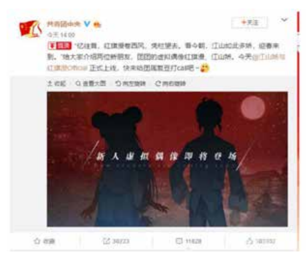
Fig. 7: Virtual idol Jiang Shanjiao and Hongqi Man.

Youth League's idol "Jiang Shanjiao", were immediately considered to be a political threat to the stability of society, and censored (Communist Youth League 2020). On 17 February 2020, the Communist Youth League released two virtual idols<sup>5</sup> on its official Weibo account – Jiang Shanjiao (female figure, left) and Hongqi Man (male figure, right). These idols were meant to represent the national image, but were removed after only a few hours, due to heated online debate (Fig. 7).