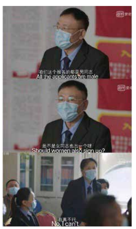
Fig. 13: Male volunteers.

and winter 2020. Critics complained about an anti-Covid-19 television series broadcasted by CCTV (Guangdong A, B, C, Ding Film Industry 2020) with the hashtag "#Stop broadcasting 'Heroes in Harm's Way'#", which was read by 140 million users (Wang 2020b). In one particularly controversial scene, a government official asks employees working for Wuhan Public Transport Company to join an anti-epidemic transportation team. Only men were shown standing up to volunteer, with almost all women (except a female bus driver) refusing to join the emergency team due to family obligations (Fig. 13).