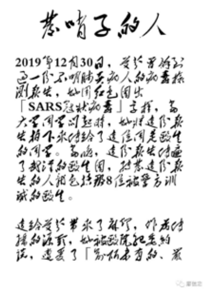
Fig. 12: Mao's calligraphy version.

These cases (i.e. the delayed censorship of Liang Yu's blog documenting the donation campaign, and the immediate censorship of the debate concerning the national female virtual idol Jiang Shanjiao and female doctor Ai Fen's critique of male hospital managers) illustrate an attempt to 'anaesthetize' feminist criticism through censorship during the height of the epidemic (January-March 2020). However, they also illustrate netizens' creative attempts to circumvent these forms of Internet surveillance. Debates concerning gender equality