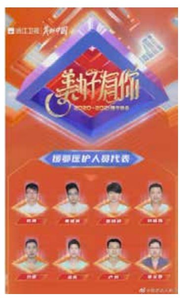
Fig. 14: Representatives of medical workers in Hubei are all male.

Despite feminist criticism throughout 2020, it is astonishing that television shows at the end of the year continued to present only male medical workers (Zhejiang TV 2021), as the following screenshot of the television show illustrates (Fig. 14):