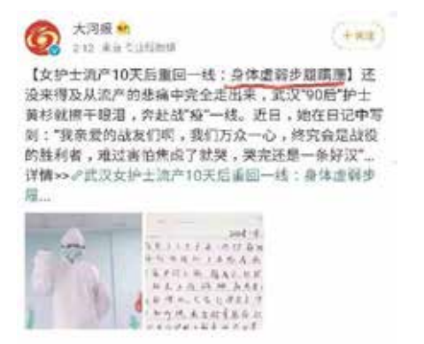
Fig. 2: Combat-ready after miscarriage.

Journalists cover nurses who rush back to the "battlefield" after miscarriage (Fig. 2) and risk the health of their unborn babies for the sake of disease containment (Fig. 3), as the following two screenshots from media reports illustrate: