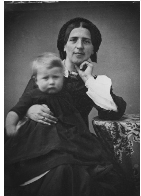
Figure 3. World famous author Johanna Spyri (1827-1901) with her son

Since its foundation, the Spyri-Archive has been part of the institute. The archive gathers research material about the world famous children's books writer and her book Heidi (1880) from all over the world, including many noted studies as well as unpublished research results concerning various aspects of her life and work, especially the reception history. Various original documents describe the history of the world reception and also the life of the author is well documented. Part of the archive includes original photographs of Spyri and her close relatives. These photographs are also integrated as part of the catalogue enrichment in the NEBIS catalogue. In the past, different exhibitions presented personal material of Spyri belonging to the institute, among them the original writing desk, and a porcelain tea cup donated to Spyri by the close friend of the family, Richard Wagner (1813-1883), the world famous German composer, who was living in the same building in Zurich. In 2011 SIKJM handed over more than 1,000 documents on deposit to the Central Library of Zurich. These include numerous letters, manuscripts, notes and documents of Johanna Spyri, their families and from their friends.