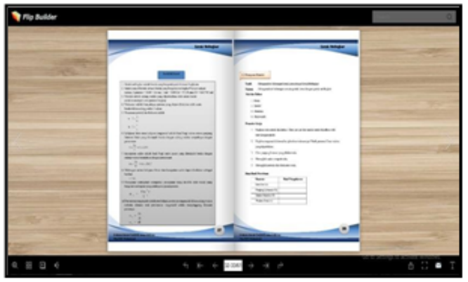
Figure 7. E-module Summary

The summary contains a brief explanation of the entire learning material, making it easier for students to remember the essence of the material studied (Figure 7).