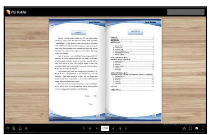
Figure 2. Preface and Table of Contents of the E-module

module as teaching materials. The parts of the teaching materials presented in the table of contents are the foreword, table of contents, glossary, concept map, introduction, 1st learning activity, and 2nd learning activity, summary, evaluation, and bibliography (Figure 2).