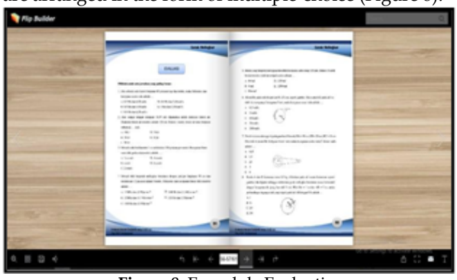
Figure 8. E-module Evaluation

The evaluation contains questions based on the learning materials in the CinQASE e-module. Questions are arranged in the form of multiple-choice (Figure 8).