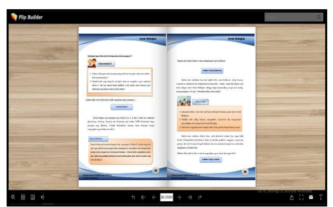
Figure 6. Learning Activities in E-modules based on the CinQASE Model