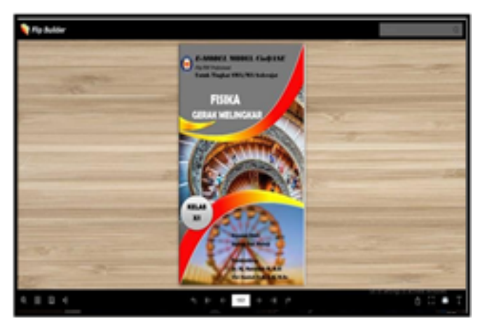
Figure 1. E-module Front Cover

The front cover of the CinQASE e-module consists of the title of the teaching material that matches the material, the name of the developer, the appropriate image, and a statement that the CinQASE e-module is used for 10th-grade Senior High School students (Figure 1).