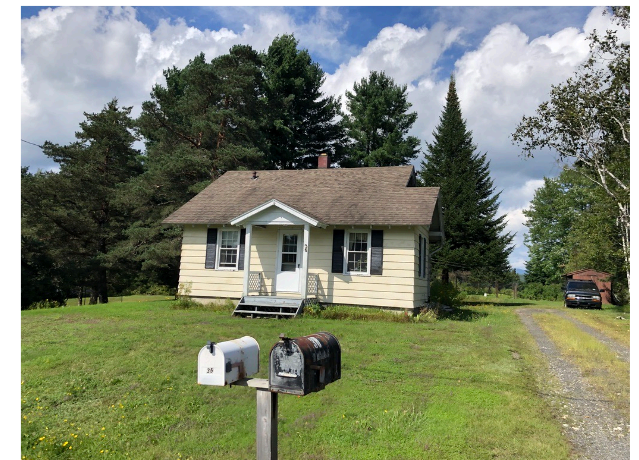
An Adirondack Home