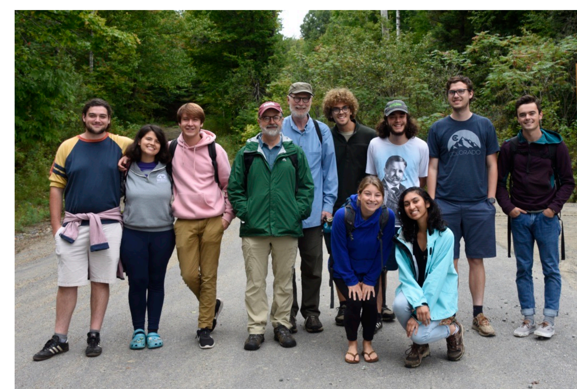
Your 2021 Adirondack Miniterm