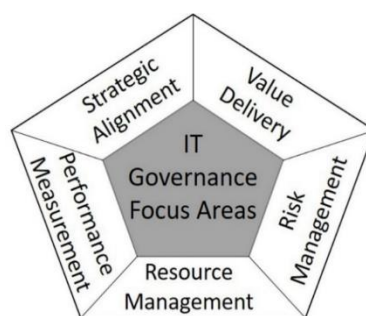
Figure 1. IT governance focus [7]

Information Technology Governance Institute (ITGI) defines that IT Governance can be applied to almost all kinds of organizations, including aligning IT strategies with the organization's policies. Efficient IT resource allocation can help the organization carry out performance measurements to get an overview and assess how far the organizations have met their goals [11]. The primary purpose of IT governance is to invest in the business value creation and risk reduction by implementing a well-defined organizational structure. The focus IT governance can be divided into 5 parts namely; strategic alignment, value delivery, risk management, resource management, performance measurement [7] as shown in Figure 1.