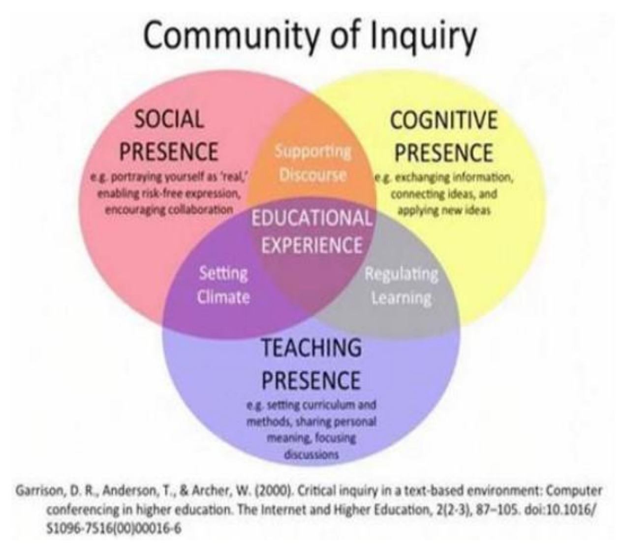
Figure 1. Community of Inquiry Model

According to Dewey, in education the questioning process is a process of investigating a problem and the issues that arise, not just remembering the solutions obtained. The process of asking questions in an educational community focuses on learning goals and outcomes. This process is a systematic process for defining relevant questions, conducting investigations for pertinent information, seeking alternative solutions and implementing these solutions. A successful Community of Inquiry depends on purposeful and respectful relationships that encourage both faculty and students to be free to express opinions so that open communication occurs.