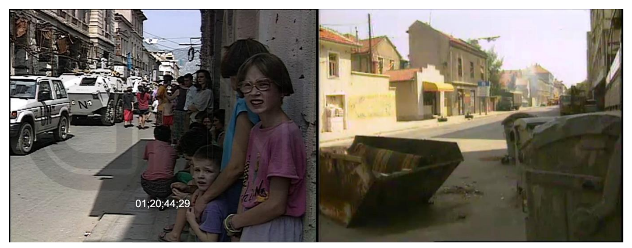
Figure 4: Marshall Tito Street in Mostar, crowded when a convoy is in town (CNN rushes), and almost empty in a BBC report.

A general focus on children among the wounded in the hospital reveals a preoccupation with the humanitarian aspects of the story. This falls largely within the framing, widespread in the coverage of the conflict in Bosnia, of the local population as "victims" and the UN and NGO officials as "saviours", even though in Mostar the local population managed to keep up a significant level of organisation against tremendous odds. One effect of this kind of framing is to downplay the agency of the combatants as political actors, distinguishing only, or at least primarily, between perpetrators and victims.