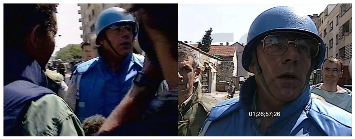
Figure 3. The same moment in the interview with Thornberry from both the UNTV and CNN rushes.