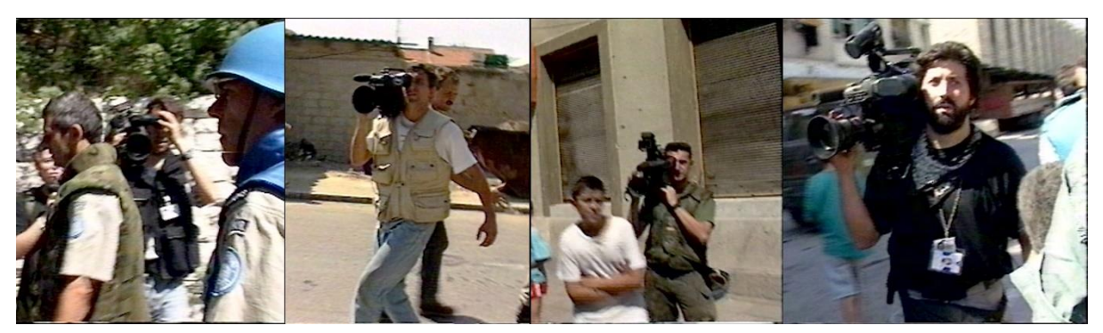
Figure 2. Frame stills showing other cameramen in the UNTV rushes of Mostar on 21 August 1993, currently held by the Imperial War Museum, London. © United Nations (IWM UNT 933)

1993, at least four other cameras can be discerned: the CNN crew, a TVE (Spanish TV) crew, a Spanish army cameraman and one unidentified crew.<sup>39</sup> A brief, impromptu interview in the street with the UNPROFOR spokesman, Cedric Thornberry, is covered by at least three cameras.<sup>40</sup>