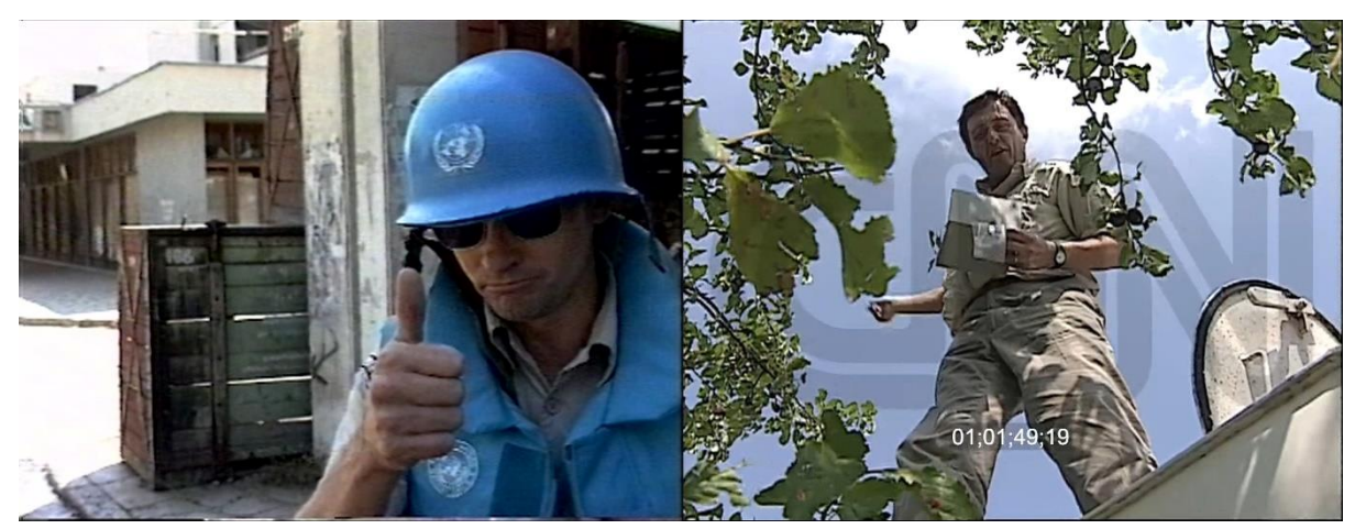
Figure 6: Joking to the camera in the UNTV and CNN rushes.

from 21 August, two of my ex-colleagues from the UNPROFOR P&I department occasionally lean into the camera to make a quip with the punchline "psy-ops is looking out for you ". <sup>66</sup> At the end of the second reel, in the aircraft back to base, one of them holds up a note to the camera with a cryptic message which he proceeds to stuff into his mouth. <sup>67</sup>