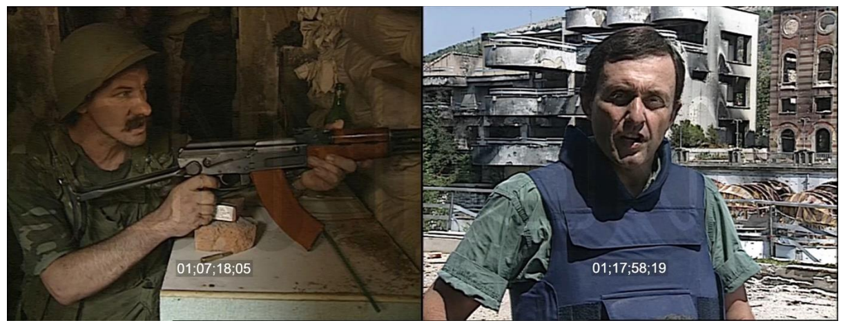
Figure 5: Unused scenes from the CNN rushes.

The BBC report from 23 August, which makes use of some of this CNN footage, briefly mentions political aims in the last 20 seconds of the report, but not in a way that all of the residents of East Mostar would recognise. The commentary suggests an equivalence of ethno-nationalistic aims ("the Croats insist Mostar is the capital of their self-declared Bosnian Croat state; the Muslims are battling to claim it as part of their rump-Muslim state"), which ignores the fact that the Sarajevo government had at least the stated aim to be the government of all citizens of Bosnia-Herzegovina, regardless of their sectarian affiliation, and not just of a "Muslim state". Interestingly, of the exfighters I've spoken to in Mostar over the course of my research, the majority described themselves as "anti-fascist" fighters, pitted against the "fascist" Croatian HVO, many of whose members openly celebrated the Ustashe, the Croatian fascists allied with the Axis powers in the second world war. The Titoist Partisan past was, and is, openly celebrated by these "anti-fascist" fighters, and still today the division in Mostar appears not necessarily as an opposition between Bosniaks and Croats (notably some Serbs and Croats joined in the defence of the East Mostar enclave), but equally as an opposition between those who reject the Partisan past (and often celebrate the Ustashe), and those who celebrate it. The supposition between the custashe), and those who celebrate it.