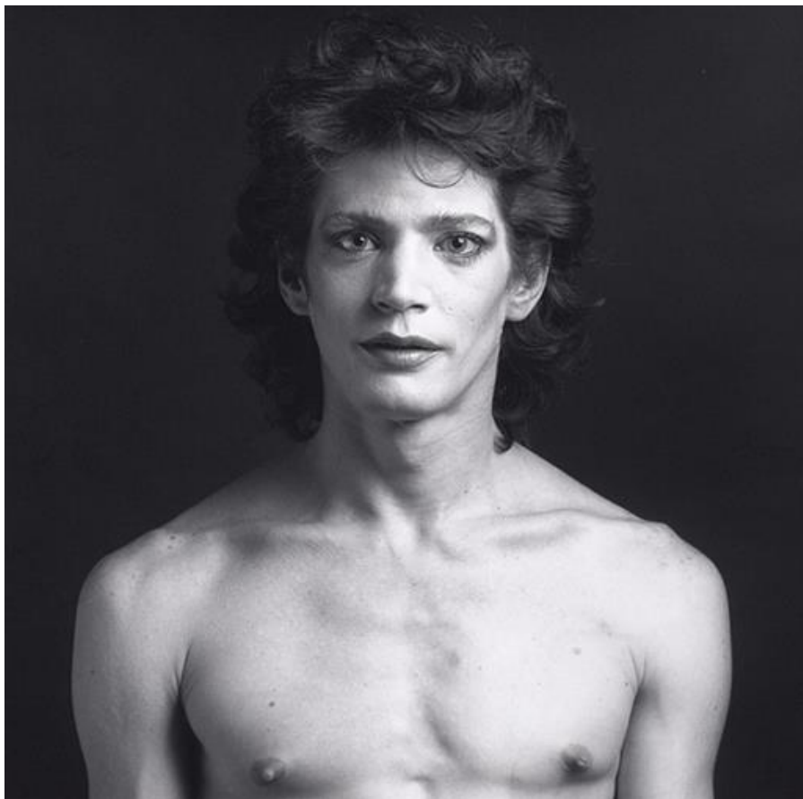
Image 3. Robert Mapplethorpe. 1980. Self-Portrait as Cross-dresser. Photography. Recovered from http://www.mocp.org/