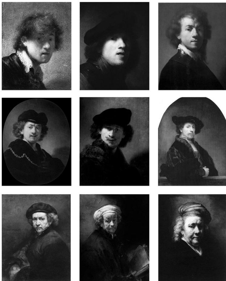
Image 2. Rembrandt van Rijn. Self-portraits dated 1629, c. 1629, c. 1629, 1633, 1634, 1640, 1659, 1661 e 1669 (from left to right, from top to bottom). Oil on canvas or wood. Recovered from [see note 1].