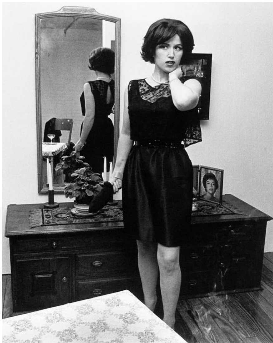
Image 4. Cindy Sherman. 1978. Untitled Film Still #14 . Photography.