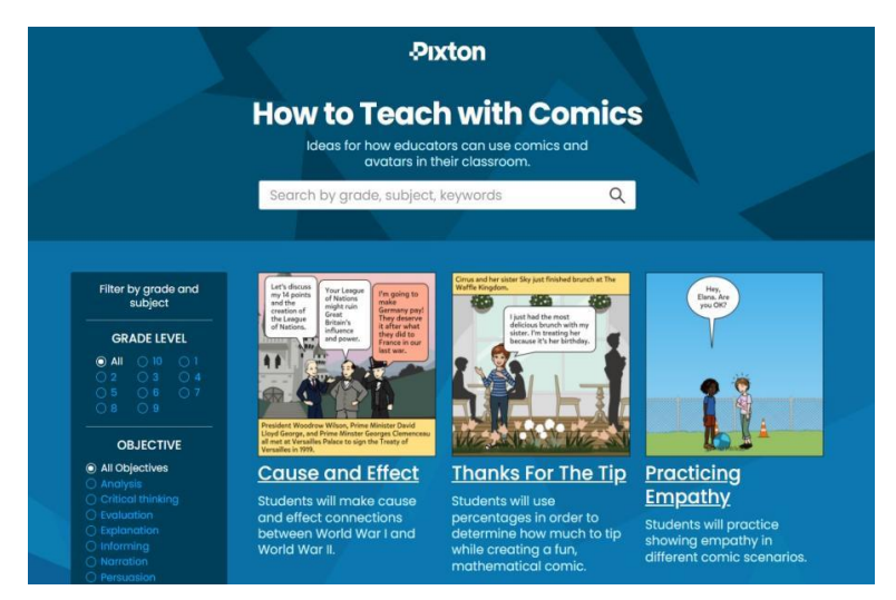
Figure 2. Lesson ideas in Pixton

Tables 1 and 2 present the collected data organized in three columns; Titles, Descriptions, and Categories. Titles refer to the names of the lessons on the website, Descriptions explain students' activities, and Categories explain in which reading subskill the lessons can be categorized.