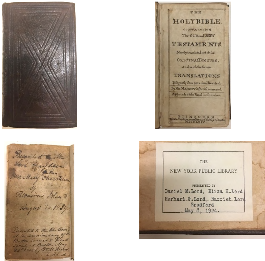
Figure 4a - The Pitcairn Bible: binding (top left), 4b - title page (top right); 4c - front matter (bottom left), and 4d back matter (bottom right). The Brooke Russell Astor Reading Room for Rare Books and Manuscripts. The New York Public Library.