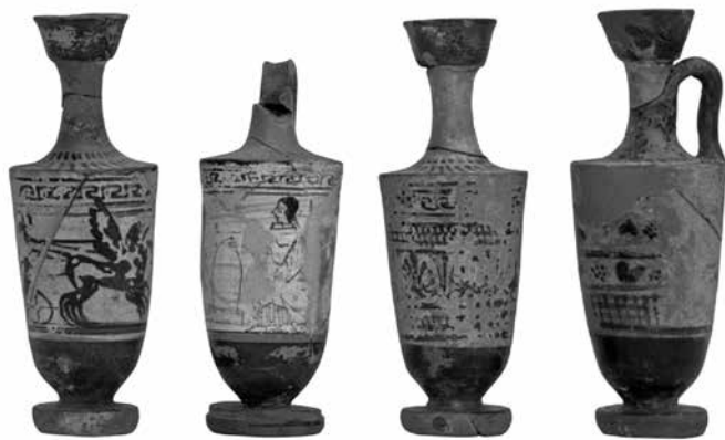
Fig. 12 Athens, Kerameikos. Vases from burial H 82

a mirror in her outstretched hand. The ornament lekythoi are all from the Beldam workshop, and seven of the twelve are very similar in size and shape and have the same patterns of decoration. We can imagine that these seven at least were purchased as a lot for the funeral, with a clear desire to make a large offering. Given the generic imagery of the two figure-decorated vases, the number of vases present in the grave is clearly more significant in making statements about the dead than the imagery on the vases 44 .