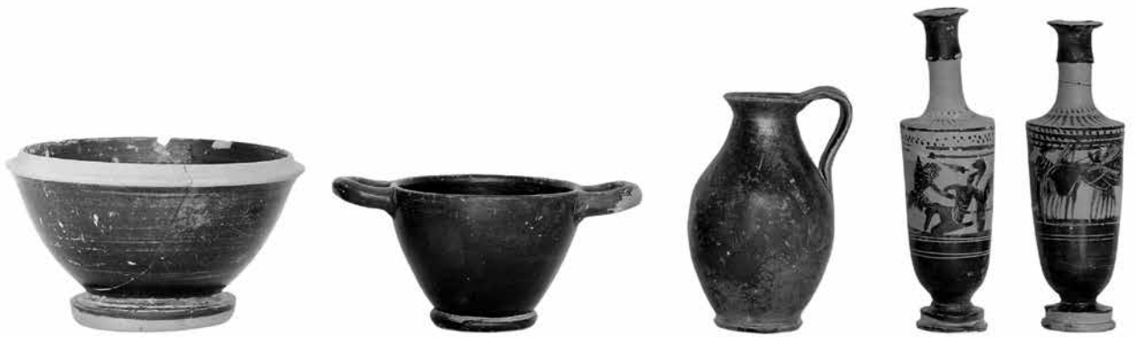
Fig. 10 Athens, Kerameikos. Vases from burial SW 130