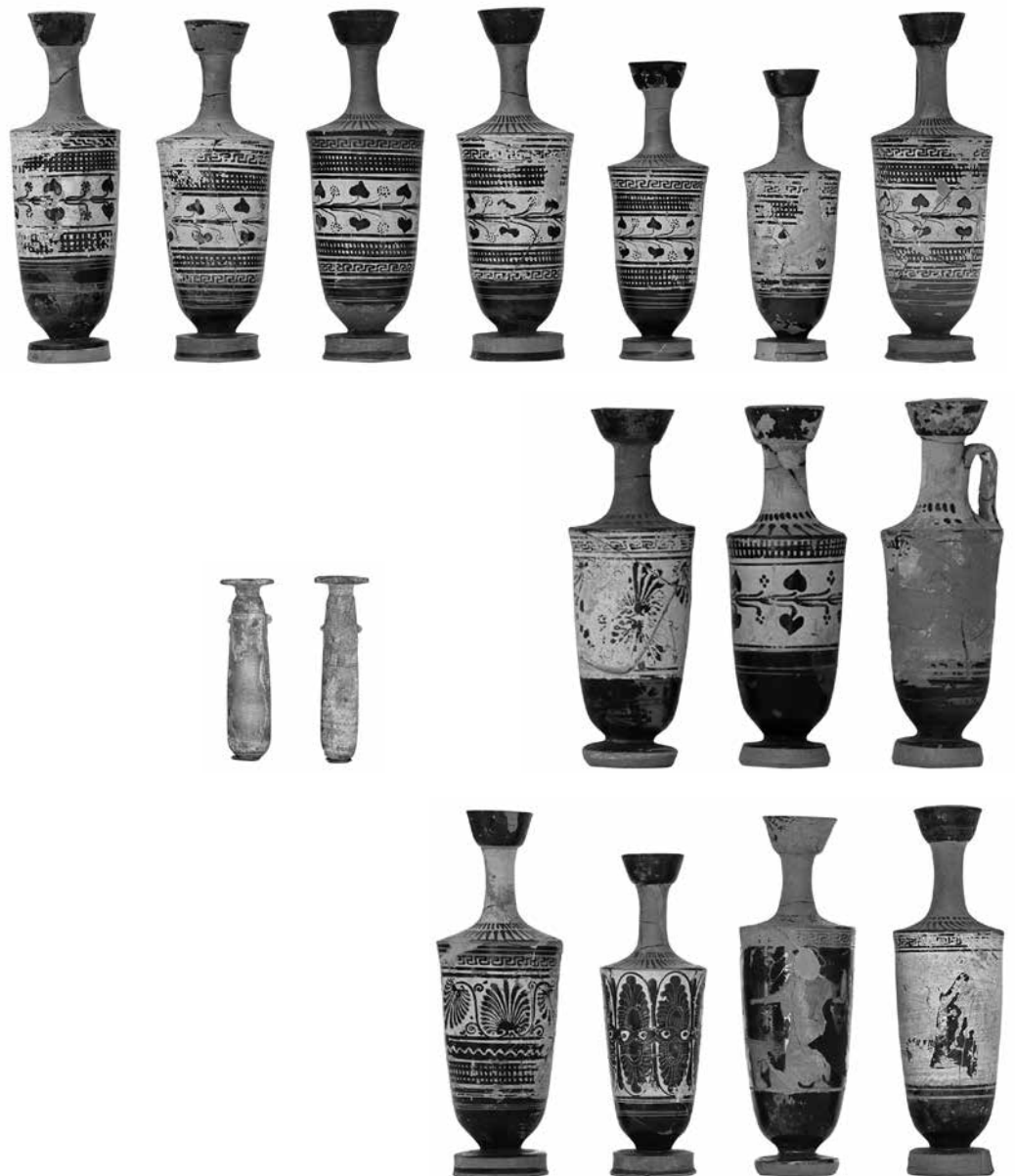
Fig. 11 Athens, Kerameikos. Vases from burial S 12