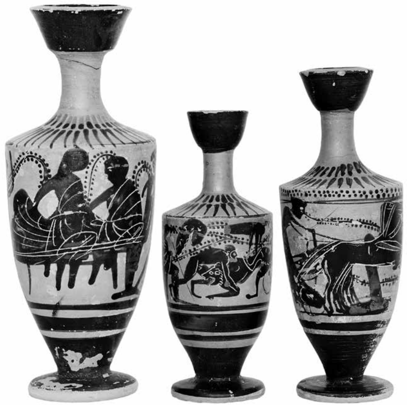
Fig. 4 Athens, Kerameikos. Vases from burial SW 69

burial, the scene has minimal incised detail. All three vases are of a similar shape and craftsmanship, with similarly hasty painting. These vases are remarkable with regard to neither their iconography nor their style and are representative of child burials (and really all burials) of the period.