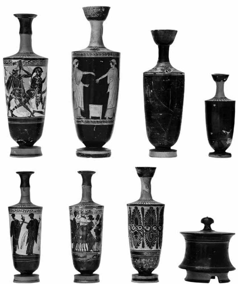
Fig. 7 Athens, Kerameikos. Vases from burial 35 HTR 47 II

have been preferred for deceased of one gender and may have also served as an opportunity for display by offering objects beyond the ritual requirements 35 .