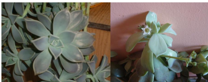
Figure 1: Graptopetalum paraguayense E. Walther ( Crassulaceae ).

Graptopetalum paraguayense E. Walther (GP) (Figure 1) is a species of succulent plant in the jade plant family, Crassulaceae . It is a succulent, drought-resistant perennial grown as ornamental houseplant in temperate regions, as it cannot survive winter outside. The plant is native to Mexico and is distributed widely in tropical and subtropical countries where it is mainly cultivated as ornamental plants, but are popular in Chinese herbal medicine. It is a widely consumed plant food in Taiwan and it is used in folk medicine. This herb possesses several health benefits. According to its archaic Chinese prescription, GP is able to alleviate hepatic disorders, lower blood pressure, whiten skin, relieve pain, treat infections, inhibit inflammation, acts as a diuretic and improve brain function.