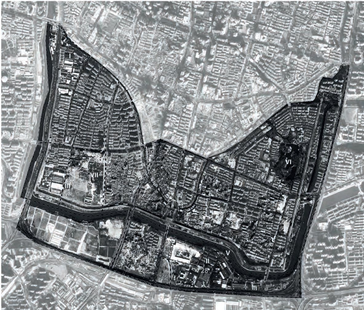
Figure 1. Analysis of the Southern part of Nanjing (Inner Fringe Area) laying block typologies upon aerial photo (by JIANG Lei, 2016).