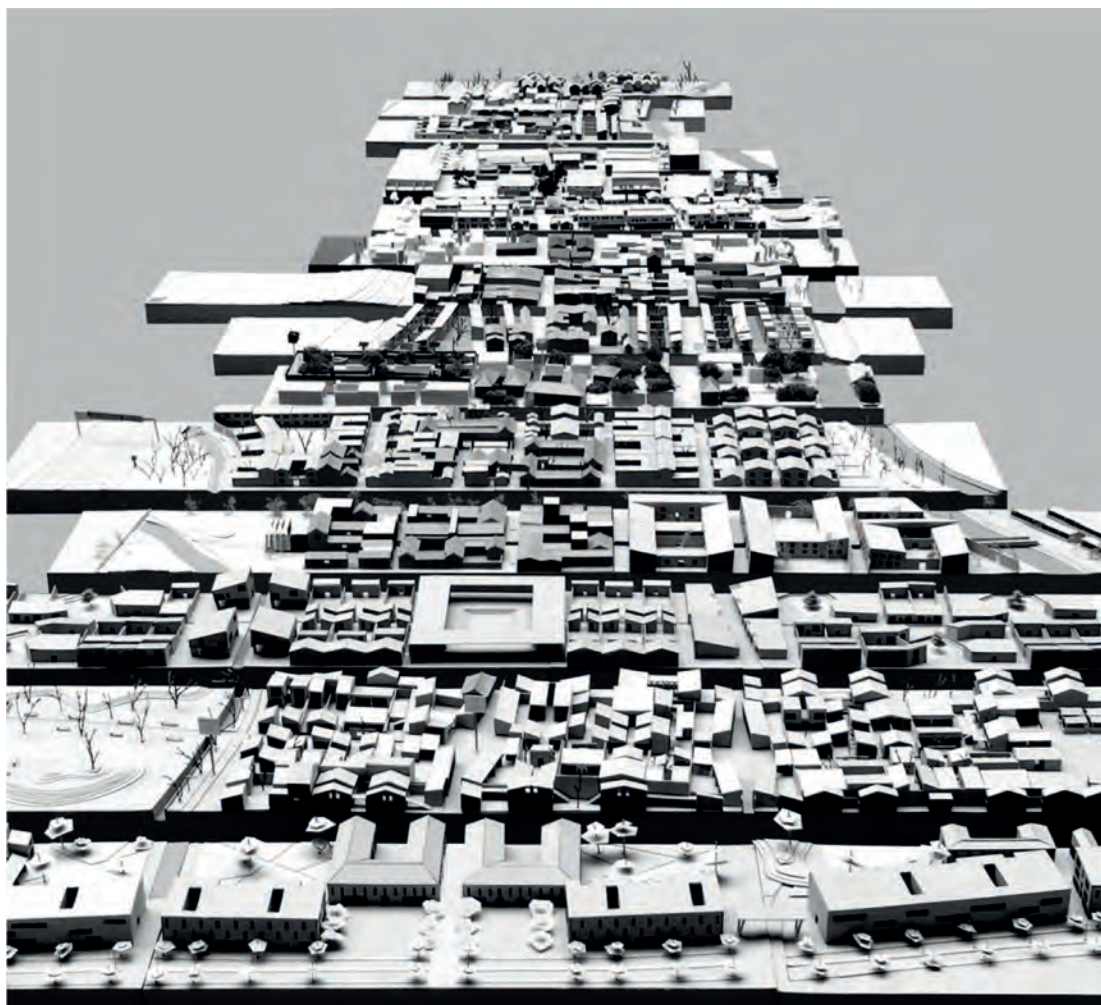
Figure 4. Studies on the Left Street cross section at Nanjing, Pukou.