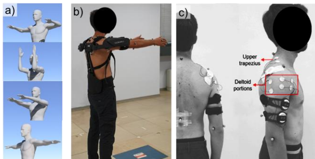
Fig. 2. (a) shows the four static postures considered in the study. (b) shows one subject wearing the MATE exoskeleton in posture P3. (c) shows the positioning of EMG electrodes.

Bipolar EMGs were collected from the anterior, medial and posterior deltoids and the upper trapezius of the right upper limb using pairs of surface electrodes (30 mm inter-electrode distance, 24 mm diameter, Spes Medica, Battipaglia, Italy) and digitized at 2048 Hz with a 16 bits A/D converter (DuePro, OTBioelettronica and LISiN, Politecnico di Torino, Turin, Italy). Kinematic of upper limbs were recorded simultaneously with EMGs by a 12 camera VICON system (100 Hz, Vero v2.2, Oxford, UK), positioning the markers according to the protocol proposed by Hebert et al. (2014) [3].