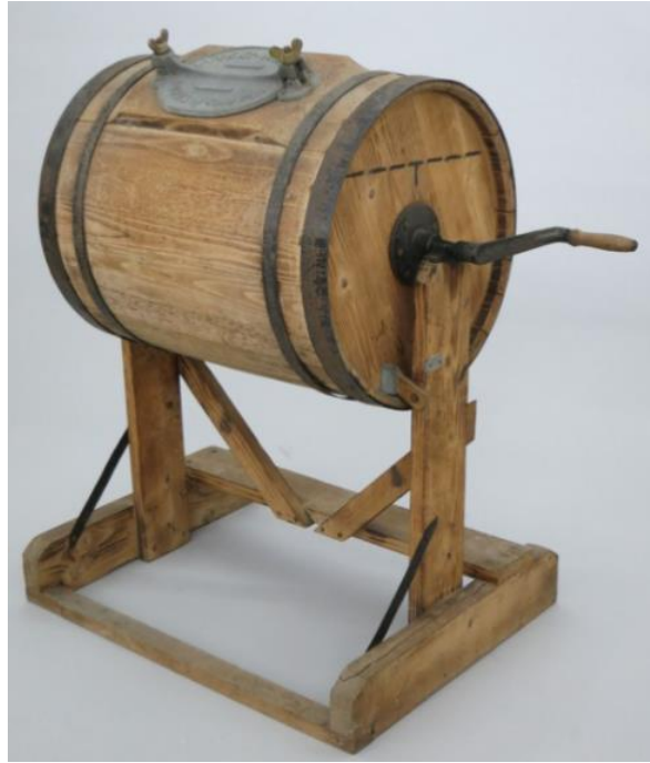
Fig. 2. Hand power washing machine.

The washing machine must be as cheap as possible, so none of its components are over-sized and new technologies (such as microcontrollers) were introduced only when their cost was affordable.