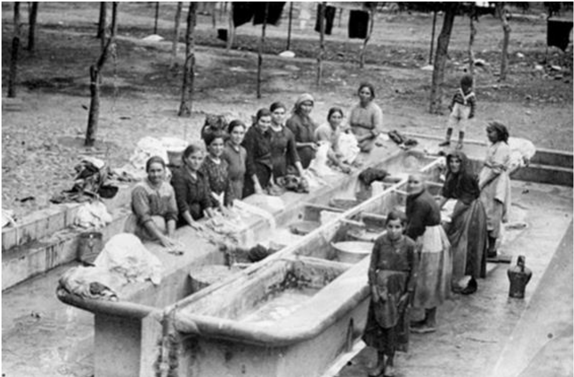
Fig. 1. Municipal wash house.

The washing machine is probably the most popular household appliance in the world. At the beginning of the twentieth century the laundry was preferably washed by hand using the nearest river or the municipal wash house (Fig. 1) although, some prototypes of washing machines were already developed to increase the washing efficiency while saving time.