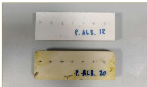
Fig 3: P. quarry sample in natural conditions (top) and after 50 thermal and moisture cycles (bottom)

The potential strength loss have been evaluated performing flexural strength and UPV measurements.