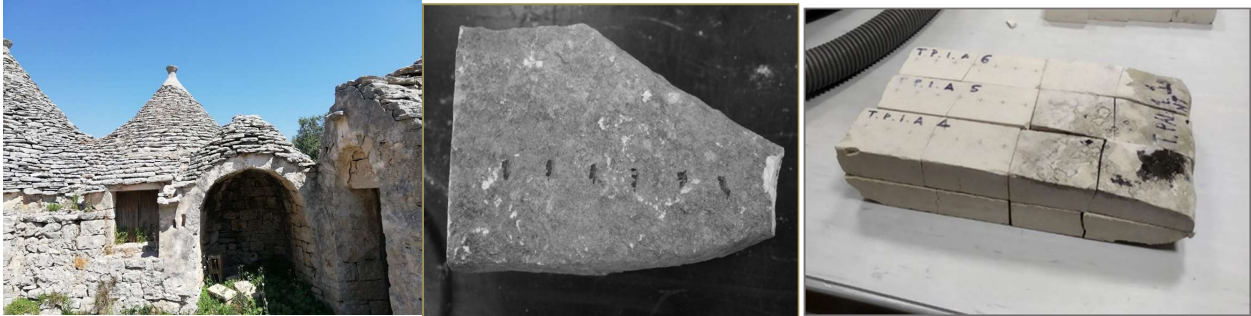
Figure 2 - The “Trullo” sampled (left) with one of the samples collected (center) and cut into specimen for the tests (right).....

The “Trullo” samples were collected from a rural construction of the first years of 1800 (fig. 2.). The samples show typical alterations characterized by brown colour and presence of lichen, typical for this kind of constructions.