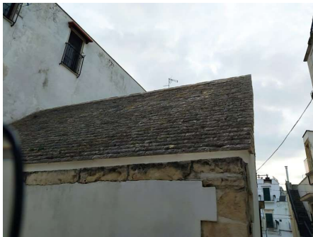
Fig. 4 Roof of a Itria Valley typical construction built with recent Chiancarella.

From the petrographic analysis the “Trullo” and the quarry sample can be classified as biomicrite according the Folk classification (R.L.Folk, 1962) . In Fig 5a the microphoto Alveolinidae and algae are well recognizable in thin section. In the microphoto of quarry sample (fig 5b) a fragment, probably a Bivalve, can be observed together with Foraminifera and algae rests.