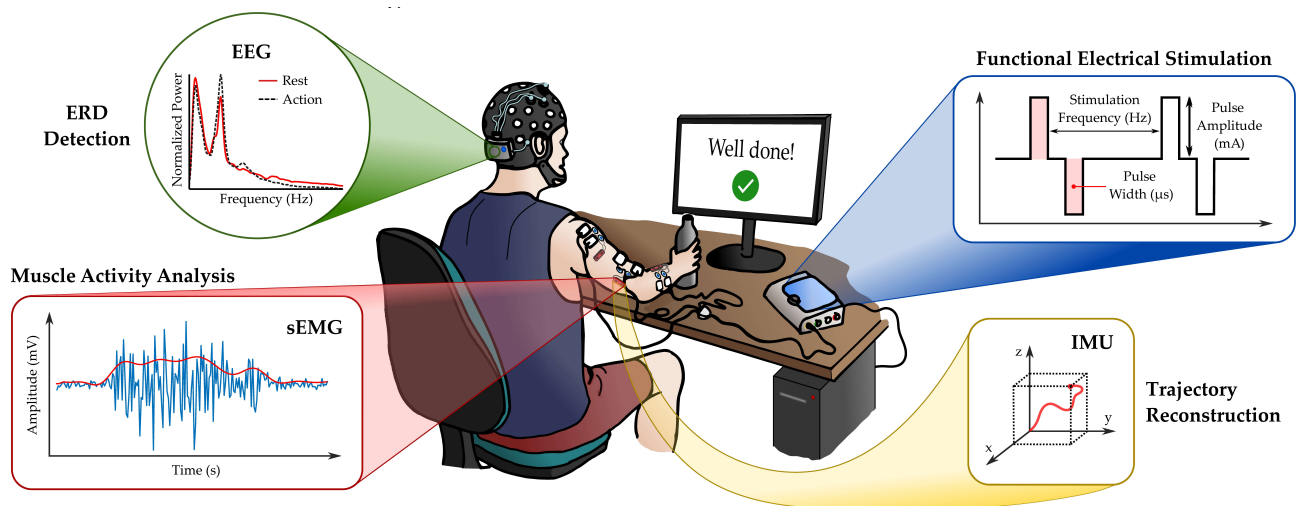
Figure 2. Overview of the system. The patient is instructed to perform the reaching of an object, typically. EEG electrodes are placed on the motor areas and stabilized by a comfortable helmet. sEMG and inertial sensors are placed on the limb of interest, next to the stimulation electrodes. A central unit processes acquired data to activate the FES when the subject needs help to reach the target. A monitor provides feedbacks encouraging the user.

and the control software (which could be installed by the user on his/her own computer or, if necessary, on a provided one). The system will receive, via Bluetooth low-energy (BLE) communications, the data from each module, process them, and appropriately modulate the FES parameters (e.g., pulses amplitude and width, stimulation frequency). Furthermore, the software features a graphical user interface, to ease the communication with both the physiotherapist (e.g., session progression, sensors data) and the patient (e.g., displayed messages), and plays the videoclips needed in the observation phase. However, if the patient subjects himself/herself to AOT at home, a properly educated caregiver must be involved, in order to assist him/her during the setup of each sub-device (e.g., ensuring proper electrode placement) and its connection to the central processing unit.