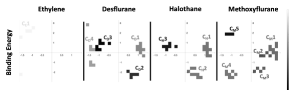
Figure 2: Per-area MM/PBSA binding energy estimate for isotype \beta IVa. Left to right: ET; DF; HT; MF. Color scale is -4 kcal/mol to -14 kcal/mol.

No significant interactions occurred with ET, which is the weakest among the four compounds in terms of clinical potency. This analysis highlights the mechanical compatibility of the contact between the three anesthetics DF, HT and MT, and tubulin in specific areas of the surface, hence suggesting the existence of preferential transient binding pockets on the tubulin dimer. These clefts are highlighted in Fig. 1, and a binding energy estimate for each ligand in each of those clefts is provided in Fig. 2.