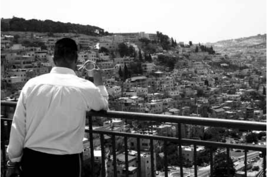
Overview of Silwan from the City of David archaeological site. Source: photo by Davide Locatelli (2010)

possible to discover which provisions of the plan are really achievable and, conversely, which provisions appear to be non-achievable.