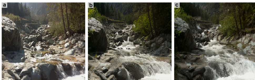
Fig. 2. Example of three images used by the landscape experts for the assessment of the Visual Elements Factor in case study 3. The images correspond to the following flow releases: (a) 100 l/s, (b) 740 l/s, (c) 1428 l/s.