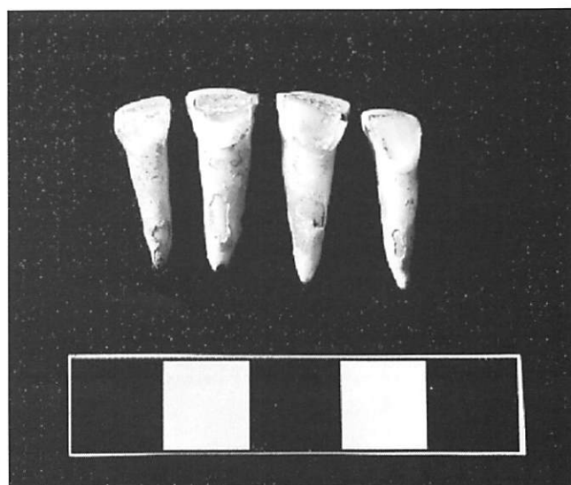
Fig. 4. Tooth wear due to heavy attrition on anterior dentition.

(sutural bones). Cases of bone remodelling are also present, such as enthesiopathies and micro-trauma (myositis ossificans) due to intense physical activities, and teeth wear, due to a heavy attrition on anterior dentition (Fig. 4).