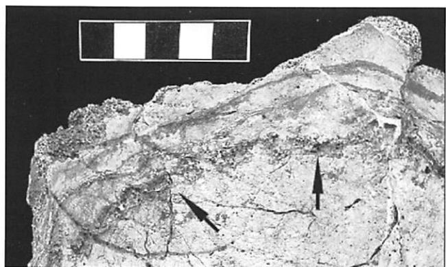
Fig. 2. Left parietal (endocranial). Traces of decomposition.

Eight individuals have been recovered until now: four male, two female, one subadult (around 16-17 years) and one infant. Average stature estimated is about 157 cm for females and 170 cm for males. The skeletons are in poor condition, showing differing degrees of preservation due to diagenetic events: only in two cases it was possible to reconstruct the entire skeleton and identify probable traces of decomposition (Fig. 2). Paleopathological analysis