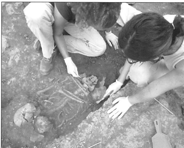
Fig. 1. Excavation of a burial.

During the archaeological campaign, some burials and assemblages of bones were excavated (Fig. 1). An isolated belt element covered by hard sediment was retrieved too.