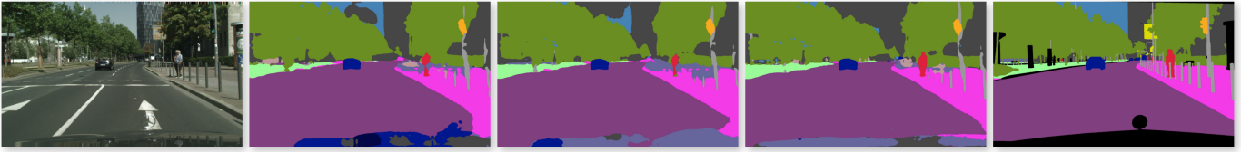
Fig. 2. Qualitative results for the GTA→Cityscapes experiment. Starting from the left: RGB, FCD, FCD-Light, FCD-Light&Thin, Ground Truth.