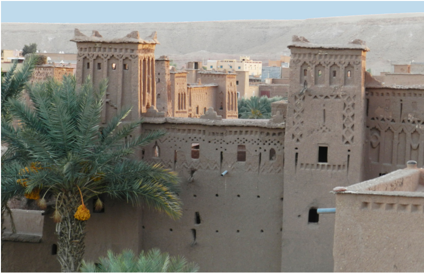
Fig. 5 The Kasbah of Tourirt in Ouarazazate (Morocco)