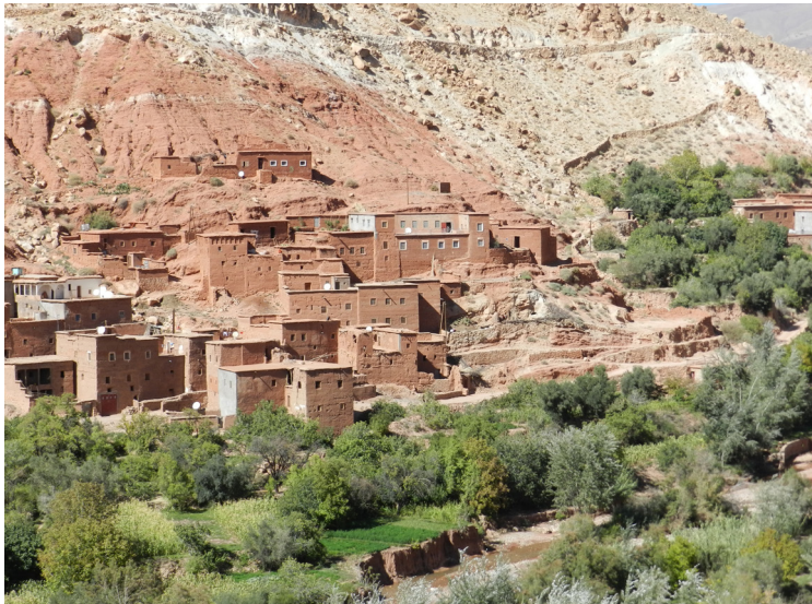
Fig. 4 Earthen settlement in Morocco (by M. Mattone, 2015)