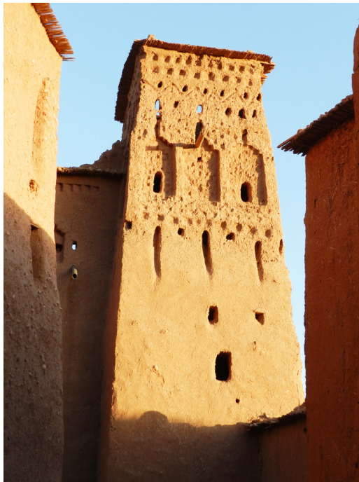
Fig. 6 Earthen building in Ouarazazate (Morocco) (by M. Mattone, 2015)