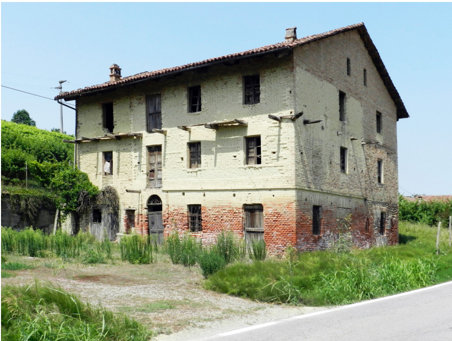
Fig. 8 Earthen vernacular architecture in Priocca (Cuneo, Italy)

In America, earthen constructions are both in the North and in the South. In North America (Mexico and Southern United States), earth was used by native populations. The Aztecs built their monumental architectures in stones, while vernacular buildings were built in adobe. The latter were also used by Europeans coming to North America for the construction of missions and frontier forts such as Tomacacori, Guevavi and Calabazas Jesuit missions in Arizona (1691). Later, in the middle of the XIX century, the US army also adopted the adobe technique to build Fort Union and Fort Selden. As for the rammed earth technique, it was brought to the American country by German immigrants. Rammed earth constructions can be found in Washington (Hilltop House), at Mount Vernon, in Trenton (New Jersey), in Canada (St Thomas Church in Shanty Bay and residential buildings in Greenville).