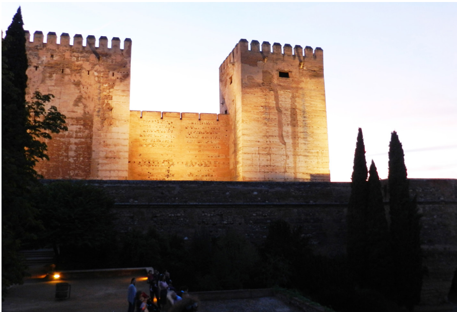
Fig. 7 The wall of the Alhambra Palace in Granada (by M. Mattone, 2017)

Phoenicians (Houben, Guillaud, 1989), is widely adopted in Spain 12 (Mileto, Vegas, 2014, García-Soriano, Villacampa Crespo, Gómez-Patrocínio, 2018), France (Guillaud, 2008), Italy (Bertagnin, 1999; Sori, Forlani, 2000; Mattone, 2010; AA. VV., 2011), Portugal (Fernandes, Correia, 2005). City walls (e.g. the ones of Cordoba, Seville and Granada), monumental buildings (e.g. the Alhambra Palace in Granada) (Fig. 7), both urban (e.g. the historic city centre of Novi Ligure in northern Italy and of Lyon in France) and vernacular architectures (such as the rural buildings of Piemonte, Sardegna, Marche, Abruzzo, Calabria regions in Italy and of Rhône-Alpes and Auvergne regions in France) can be found in different countries (Fig. 8).