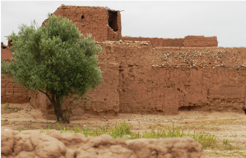
Fig. 1 Adobe rural architecture in Morocco (by M. Mattone, 2015)

adopted for the erection of earthen constructions, among these, seven are the most widespread. They are: pisé (also known as rammed earth, it is a constructive procedure that consists in "beating" - piser - the specially prepared earth inside a mobile wooden formwork); bauge (earth-straw dough adopted to shape irregular elements which, once overlapped, are regularized with the aid of a sharp blade); torchis (earth application on a timber support); adobe (construction technique that uses raw bricks, made by hand compacting, in wooden forms, a mixture of earth which are often added vegetable fibres); earth-straw (earth, which must be characterised by high cohesion, is dissolved in water and poured on the straw so as to cover it all); forming (earth is shaped by hand as if it were pottery) and compressed block (earthen blocks are produced using hand tools or mechanical presses so as to improve mechanical performances, thanks to the reduction of cavities and water content) (Fig. 1).