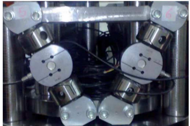
Figure 2. A pair of inclined UFTs with elastic hinges and clamping heads at both ends.

\alpha , \beta , \gamma and \delta angles are 55^\circ , 62.5^\circ , 60^\circ and 30^\circ respectively. The six UFTs have a capacity of 75 kN. These values entail a vertical force capacity of 400 kN, side force capacities of 100 kN, and moments capacity of 50 kN·m. Maximum deformations of the structure under the highest load are in the order of few millimeters. The six UFTs are connected to an external amplifier, which provides the required supply voltage to the transducers and acquires data.