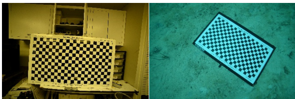
Figure 1: The calibration panel employed in the acquisition of the dataset (A) and (B) on the left; and the dataset (C) on the right.