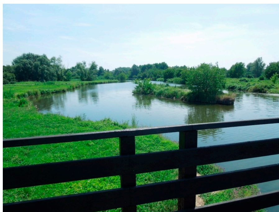
Figure 5. The walkway approaches the smaller islands without interfering with the newly recreated habitats in Parco Le Vallette. Photo Emma Salizzoni, 2020.