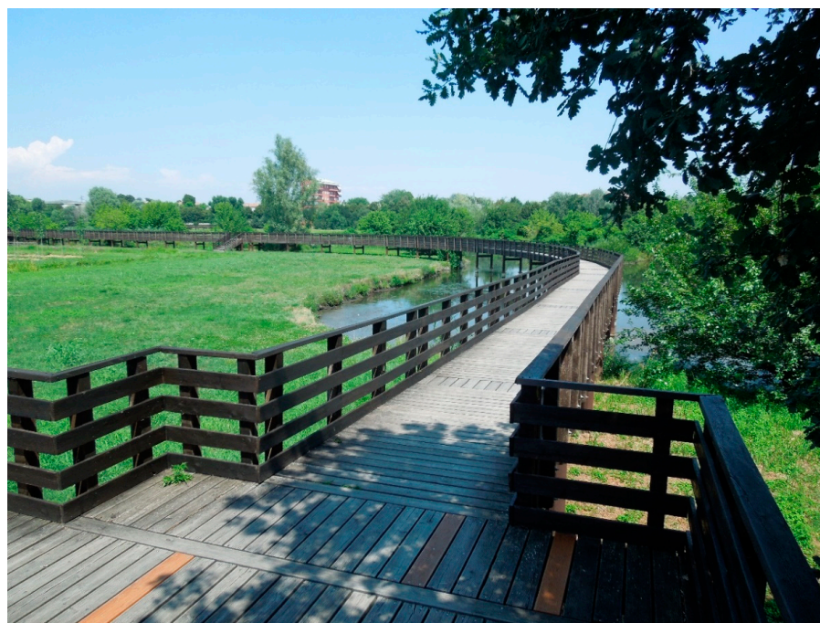
Figure 4. The walkway winding through the Parco Le Vallette wetland. Photo Emma Salizzoni, 2020.

several points stretch out to the waters allows visitors to establish a direct relationship with the wetland and a visual connection with the islands and the wildlife that lives on them. Moreover, a raised cycle–pedestrian path made of wood and steel and running for a distance of about 500 m was set up, connecting the two parts of the town. The path winds its way through the central wetland, approaching the smaller islands and passing through the main one, but without allowing access to it. Crossing the walkway, it is possible to visually appreciate the wetland as a whole without interfering with the delicate habitats (Figures 4 and 5).