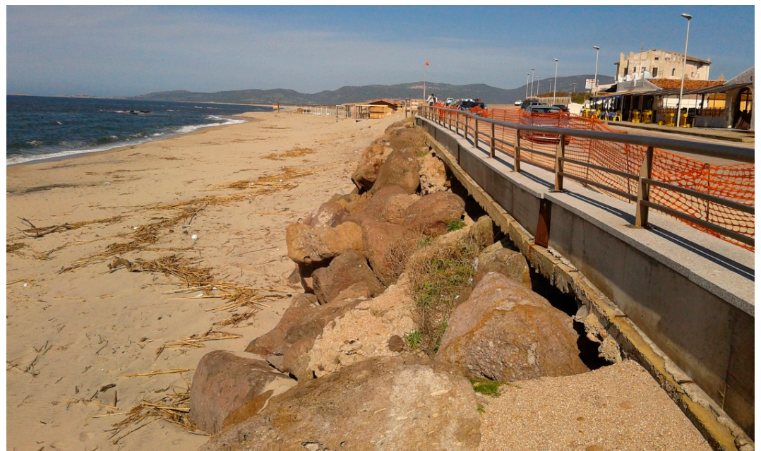
Figure 1. S. Pietro beach before interventions. The road that provided direct vehicular access to the shore had completely erased the original dune ecosystem.

original dune ecosystem (Figure 1) but had also stiffened the coastal section, encouraging significant erosion processes and an overall retreat of the coastline. In order to address the erosive dynamics as well as environmental and landscape degradation, the municipal administration of Valledoria decided to promote a radical transformation of the local landscape. The project, which was handled by Criteria s.r.l. and by P.R.I.M.A. Ingegneria (2013–2016), covered about 400 m of coastline and involved the demolition of the road, car parks, and the retaining and protecting walls and the reconstruction and revegetation of the original dune ecosystem. This is a very rare case, along the Italian coast, of restoration of the site's conditions to the status preceding the occurrence of land-taking processes. The intervention also led to a significant change in deep-rooted uses of the coastal area. The direct road access to the seashore was replaced by pedestrian access, with the installation of a walkway which leads tourists from the car park, set back from the beach, toward the coastline.