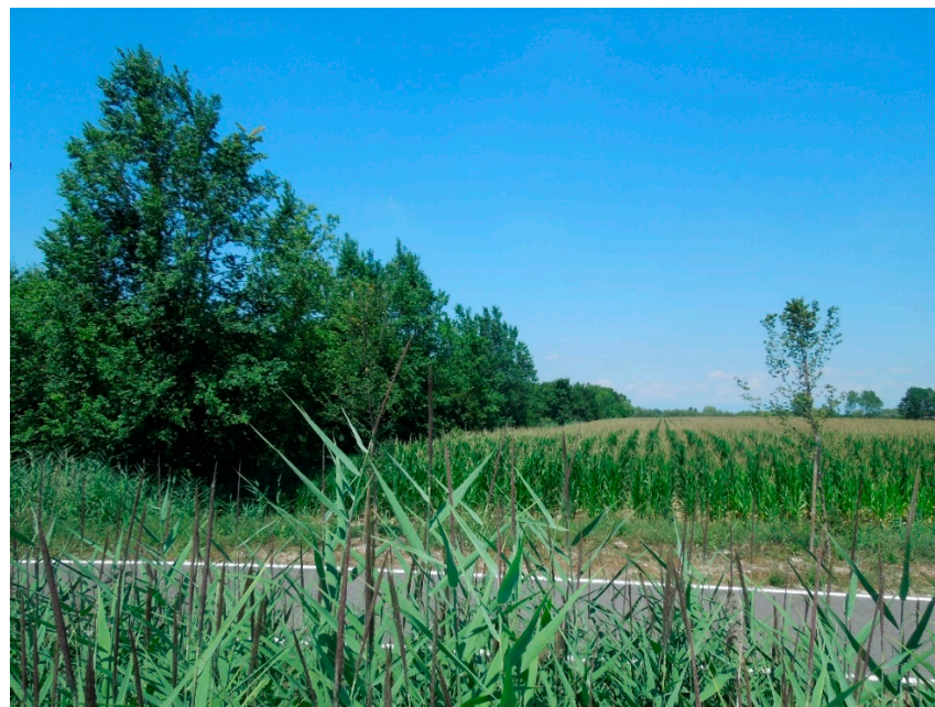
Figure 8. The close spatial interaction between Bosco Querini and the rural landscape.