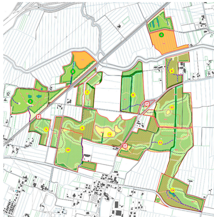
Figure 6. The Bosco Querini Management Plan (excerpt from Piano di Gestione del Bosco di Mestre—Carta degli Interventi, 2014, original scale 1:5,000): in lighter green, the sparse and visually permeable wooded areas that delimit the paths and meadows (highlighted in yellow) within the forest; in darker green, denser wooded areas, but still permeable to the eye; in brown, irregular and not permeable wooded areas that host the most delicate and inaccessible habitats (orange areas are dedicated to further woodland developments).

and irregular woodland is envisaged to discourage accessibility and host most delicate habitats (Figure 6).