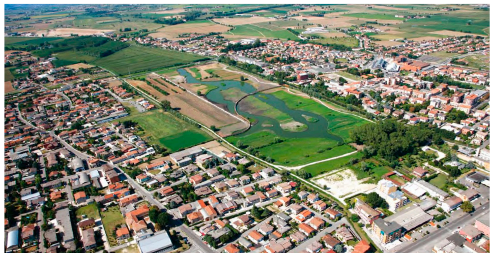
Figure 3. The wetland ecosystem of Parco Le Vallette surrounded by residential areas and road infrastructure. Photo courtesy of T.E.R.R.A. s.r.l. and Consorzio di Bonifica Veronese, 2009.

Parco Le Vallette in Cerea (Verona, Veneto Region) occupies an area of about 21 hectares surrounded by residential zones and road infrastructure (Figure 3). Before the project, the area was a peri-urban rural landscape resulting from the River Menago reclamation process which took place over the centuries. The intervention (promoted by Cerea municipality and designed by Pippo Gianoni, Dionea SA, and Marco Abordi, Terra s.r.l., 2007–2009) aimed at reconstructing the pre-existing wetland ecosystem in the place of the intensive rural landscape, to improve local biodiversity and landscape quality.