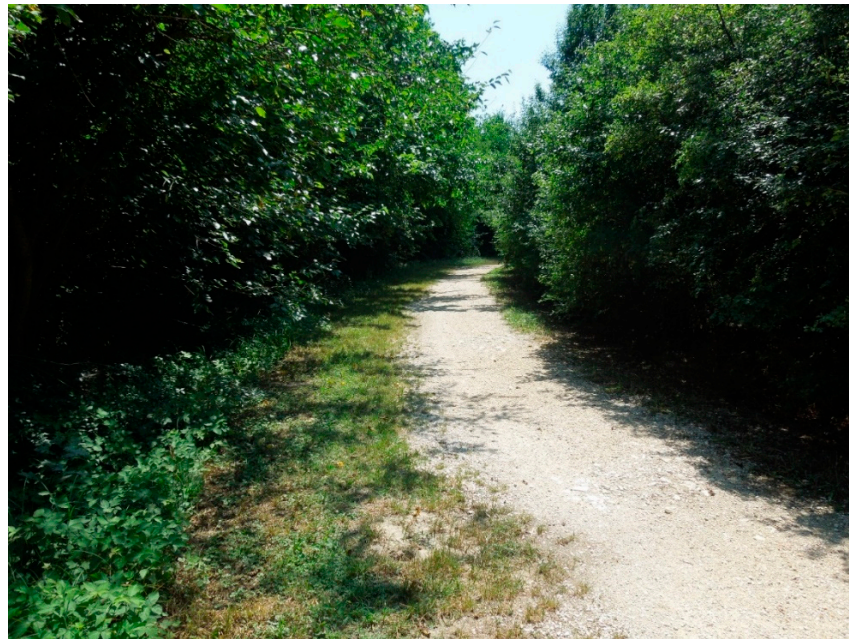
Figure 7. A pathway crossing Bosco Querini.