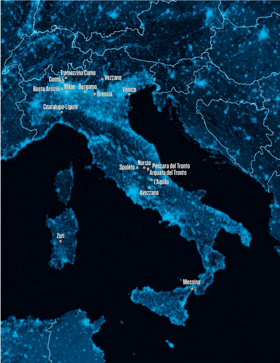
Fig.II Geographic coverage of this publication - Italy (created by Maria Diez, Fundacion Metropoli)