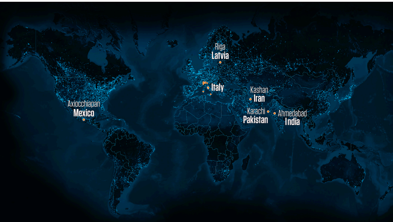
Fig.I Geographic coverage of this publication - global level (created by Maria Diez, Fundacion Metropoli)