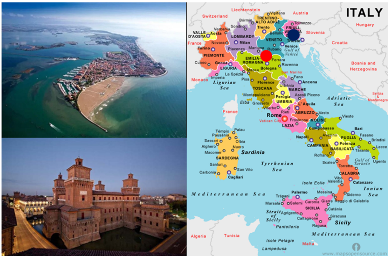
Figure 4: The Grado Locality (left side, top) in the North-Eastern part of Italy as highlighted by the dark blue circle in the map (on the right side) and the Ferrara Locality (left side, bottom) in the Central-Northern part of Italy as highlighted by the red circle in the map (on the right side).

This project consists of a geothermal doublet with one production and one re-injection wells. Geophysical surveys were needed in order to drill the Grado 1 Borehole down to 1110 m from the ground, where a terrigenous cover above a Paleogene-Mesozoic basement is present. This was accomplished during the first exploration phase in 2008. During the second phase, in 2014, the Grado 2 borehole was drilled about 1 Km to the East of Grado 1, down to 1200 m from the ground.