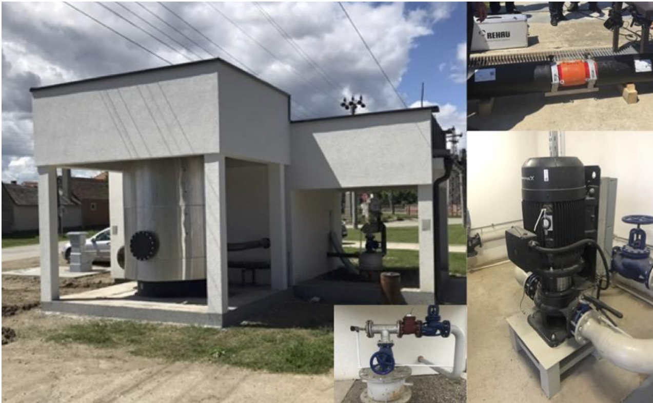
Figure 2: Preview of the Geothermal-DHC system in Bogatic