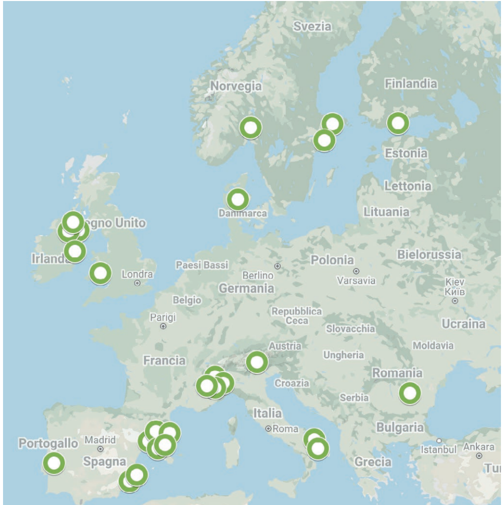
Figure 2. Effects of EPC ratings on real estate prices in Europe: countries covered by recent peer-reviewed articles.