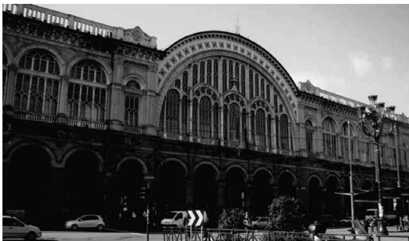
Source: Author's photo representing Turin's main train station.