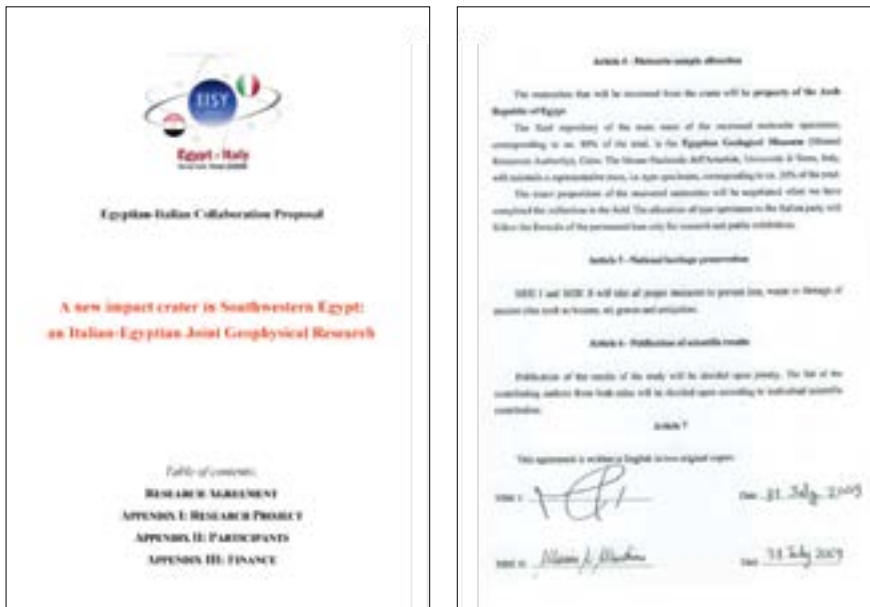
Fig. 5. Cover and signed page of the bilateral Egyptian-Italian Agreement that allowed setting up a joint expedition to the Gebel Kamil crater impact site.